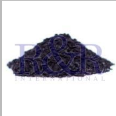
Gold Recovery Activated Carbon Granules