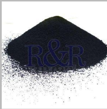
N550 Carbon Black