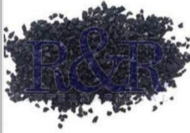
Food Grade Activated Carbon Granules