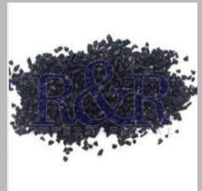
Food Grade Activated Carbon Granules