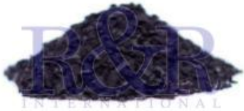
Gold Recovery Activated Carbon Granules