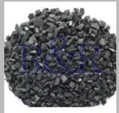
Pharmaceutical Activated Carbon Granules