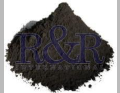
automotive emulsion activated carbon powder