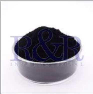
activated carbon powder