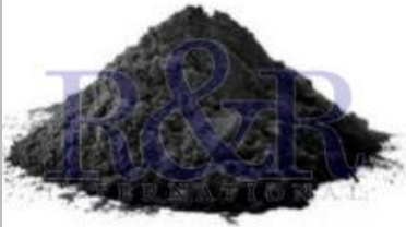
Water Purification Activated Carbon Powder