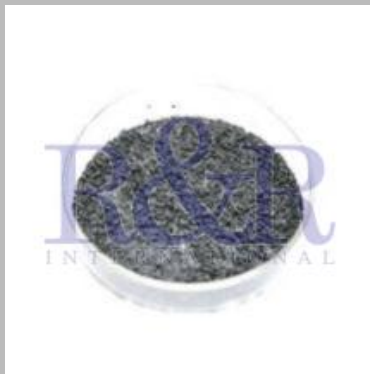
Protection Equipment Activated Carbon Granules