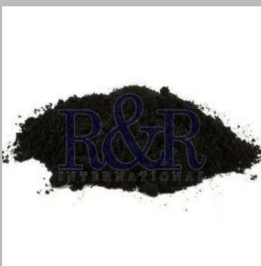
N220 Carbon Black