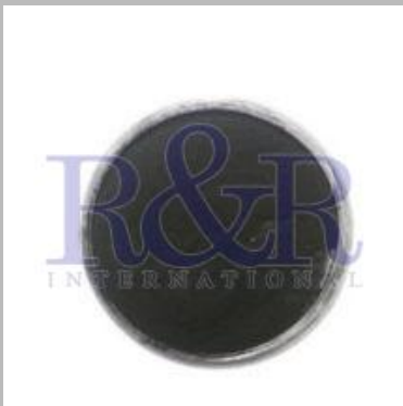
Supercapacitor Activated Carbon Granules