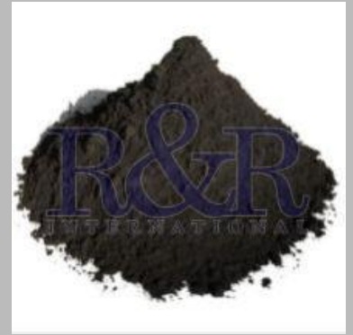
automotive emulsion activated carbon powder