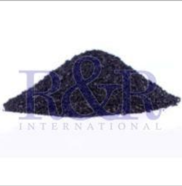
Water Treatment Activated Carbon Powder