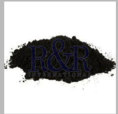
N330 Carbon Black