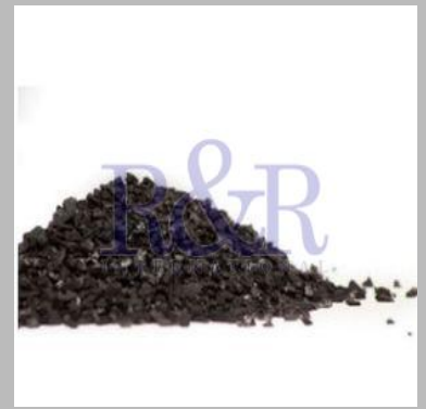
50x100 Mesh Coconut Shell Activated Carbon Granules