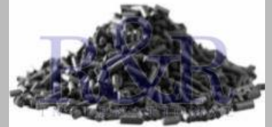
Activated Carbon Pellets