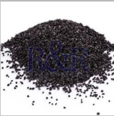
8x30 Mesh Coconut Shell Activated Carbon Granules