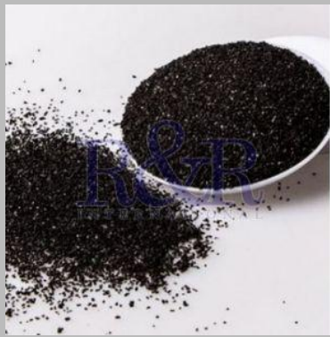
6x12 Mesh Coconut Shell Activated Carbon Granules