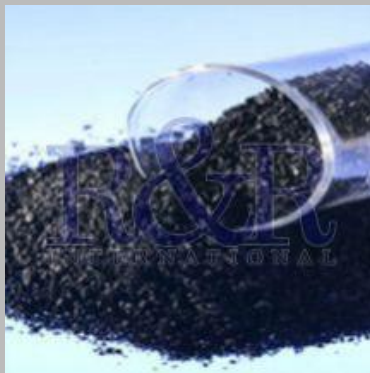
Fuel Gas Treatment Activated Carbon Granules