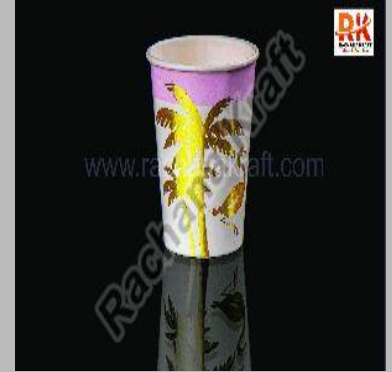
Foil Print Paper Cups