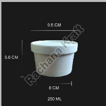
250 ML Paper Container with Lid