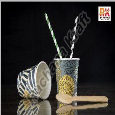
6 OZ Single Wall Paper Cup