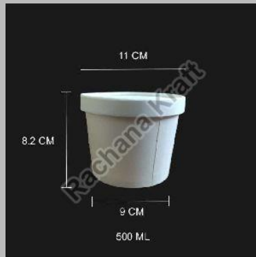
500 ML Paper Container with Lid