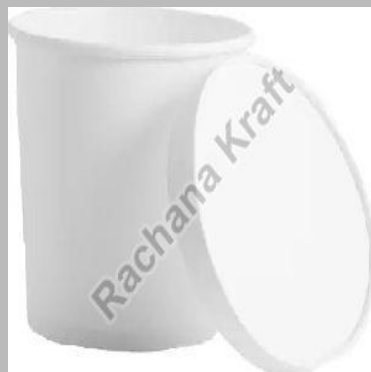
1000 ML Paper Container with Lid