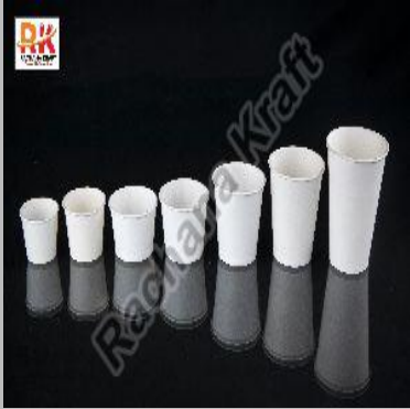
White Single Wall Paper Cup