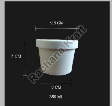
350 ML Paper Container with Lid