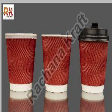
8 OZ Ripple Paper Cup