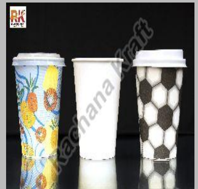
12 OZ Single Wall Paper Cup