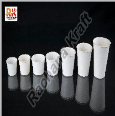
White Single Wall Paper Cup