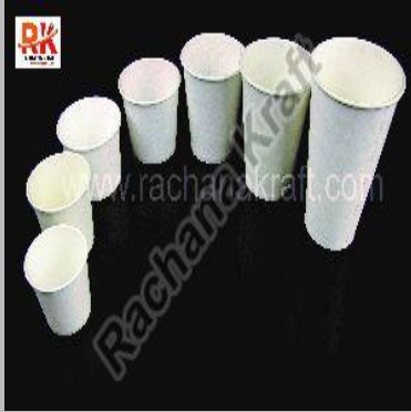
Plain Paper Cups

We Rachana Kraft are a leading and distinguished Manufacturer, Exporter and Supplier of quality Coffee Mugs, Teapot & Tea Sets, Disposable Crockery & Cutlery, Freezers, Refrigerators and Chillers, Paper & Paper Products and Paper Cups.