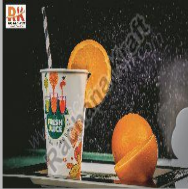
Paper Juice Cups