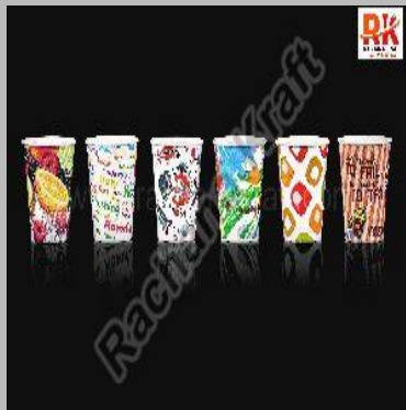
250 ML Single Wall Paper Cup