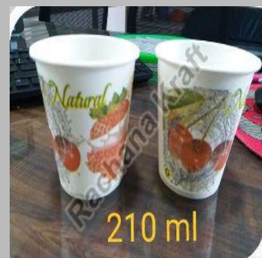
7 OZ Paper Cup