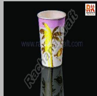
Foil Print Paper Cups