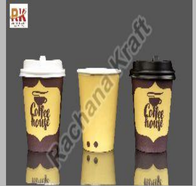
8 OZ Single Wall Paper Cup