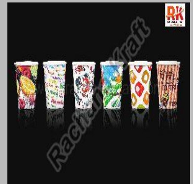
250 ML Single Wall Paper Cup