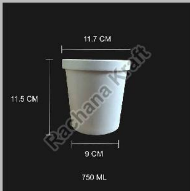
750 ML Paper Container with Lid