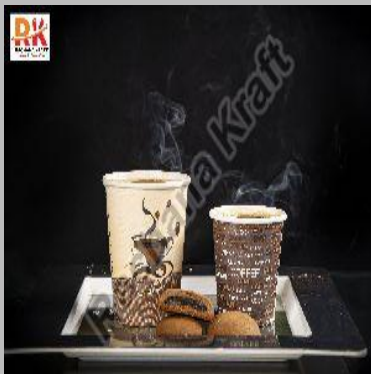
Paper Tea Cups