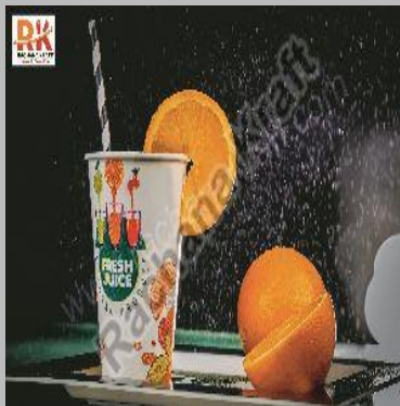
Paper Juice Cups