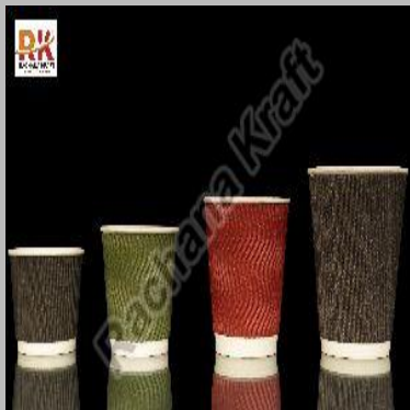
RK Ripple Paper Cup