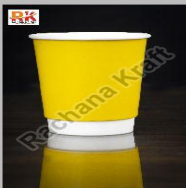
8 oz double wall paper cup