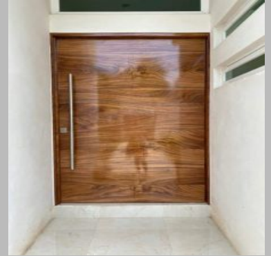
Two Panel Grooved Door