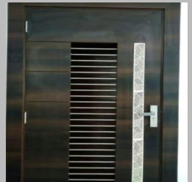
Plywood Interior Door