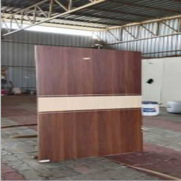
Decorative Laminate Door