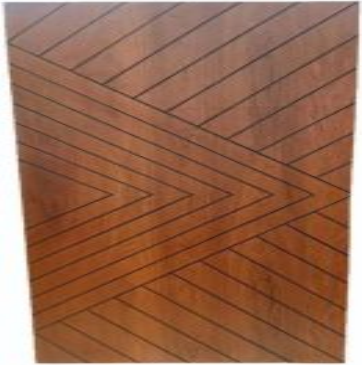
Teak Veneer Flush Door