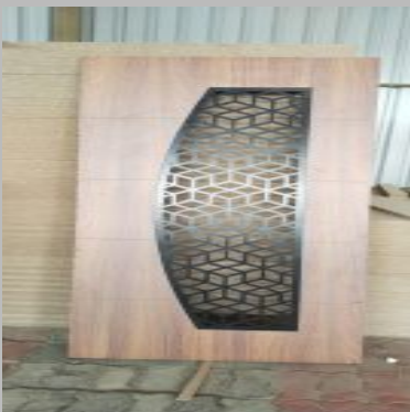
Interior Pinewood Jali Door