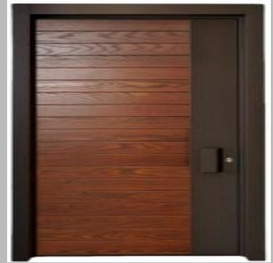
Brown Pinewood Laminated Door