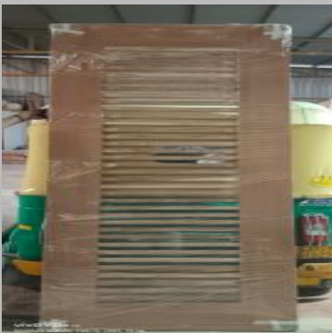
Solid Wood Interior Door