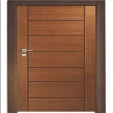
Designer Wooden Door