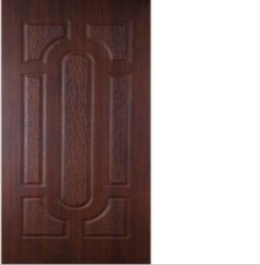
Wooden Membrane Interior Door