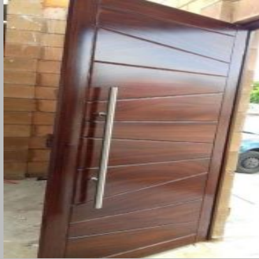
Post Forming Wooden Door Frame