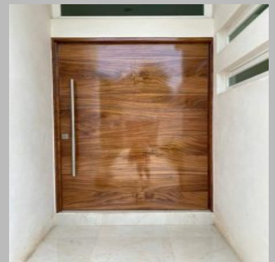
Two Panel Grooved Door