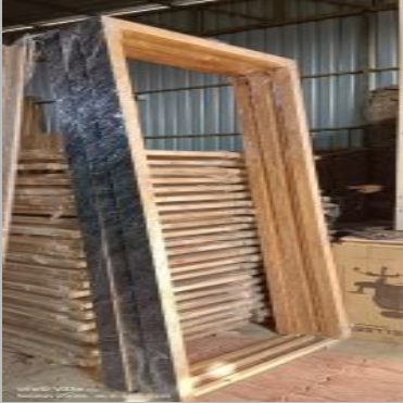
Teak Wood Door Frame