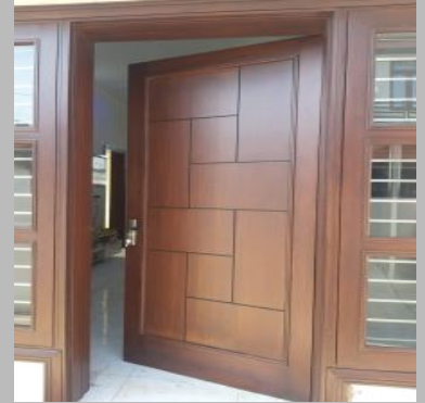
Plywood Laminated Door Frame