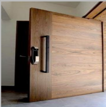
Plywood Laminated Door