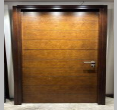
Hardwood Laminated Door