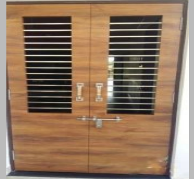
Brown Teak Wood Double Door