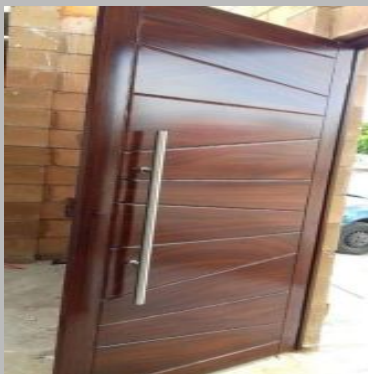
Post Forming Wooden Door Frame