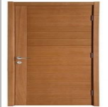
Laminated Teak Wood Door