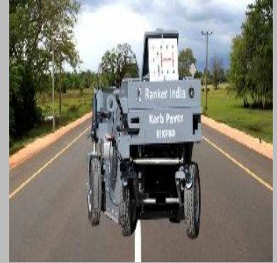
concrete kerbing machine