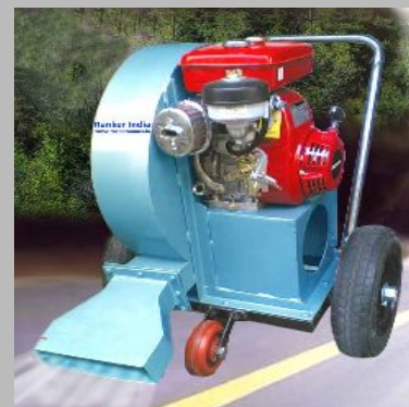
Portable Road Dust Cleaner Blower