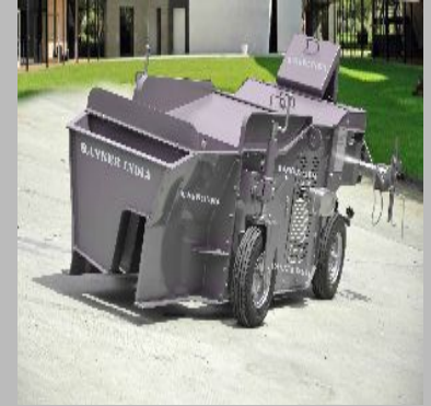
Kerb Paver Machine