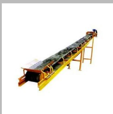
hot mix plant parts