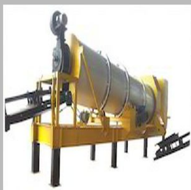
Drums for Hot mix plant