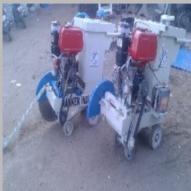
Road Cutting Machine