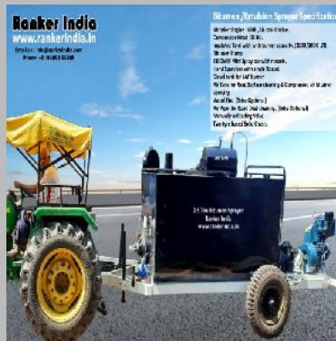
tractor mounted bitumen sprayer