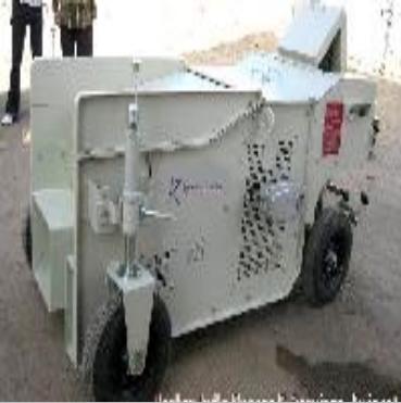
Kerb casting paver