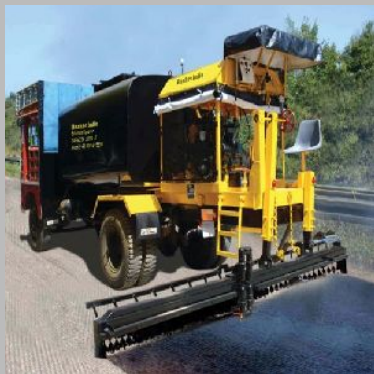
Truck Mounted Bitumen Sprayer