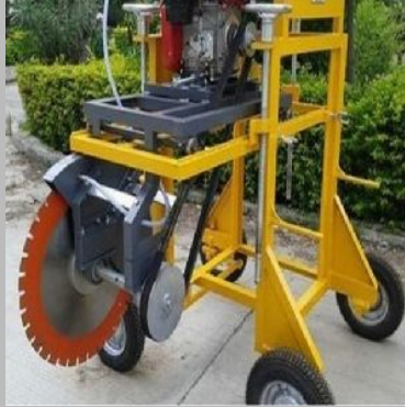
Kerb Cutter with Cutting Blade