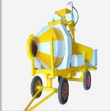
Concrete Mini Batching Plant