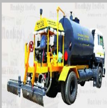
Bitumen Pressure Distributor