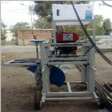
Kurb Cutting Machine