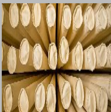
filter bags and cage