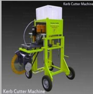
Concrete Divider Cutter