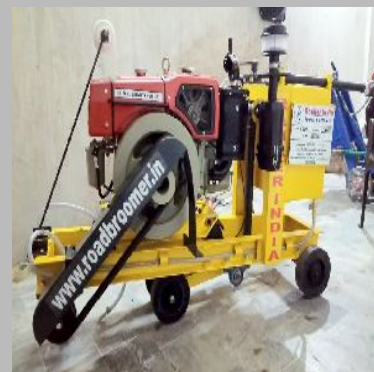
13HP VST PQC CUTTER