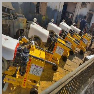
road cutter machine