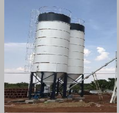
Cement Storage Silo