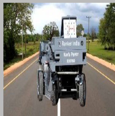
concrete kerbing machine