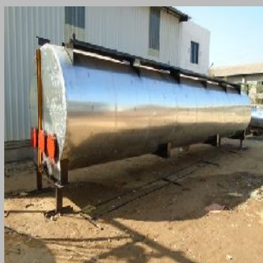
Bitumen Storage Tanks