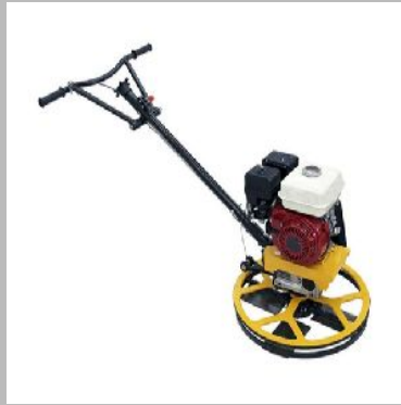
trimix flooring machine