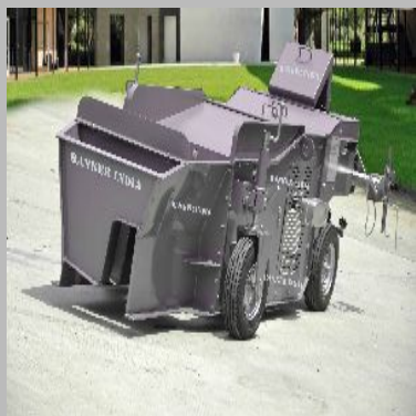
Kerb Laying Machine