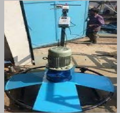
power floater machine