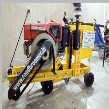
13HP VST PQC CUTTER