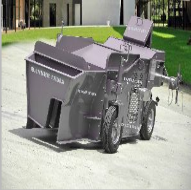
Kerb Laying Machine