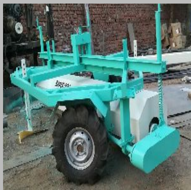
Mechanical Road Broomer