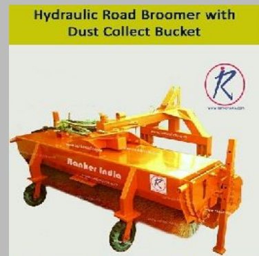
Hydraulic Road Broomer Machine