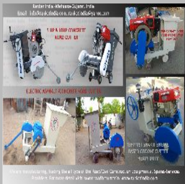
Road Groove Cutter