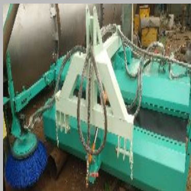
Tractor Mounted Road Broomer Machine