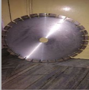
Diamond Cutting Blade