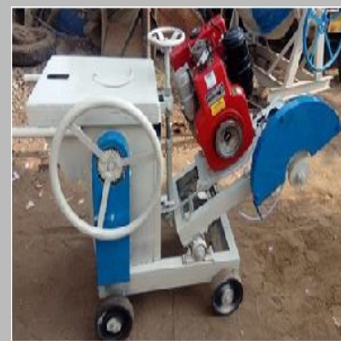
Groove CUTTER with CURB CUTTER