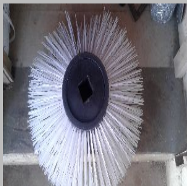
Nylon Brush wire brush