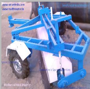
Mechanical Road Broomer