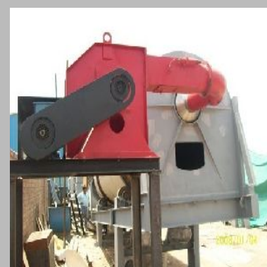
Diesel Burner and Parts