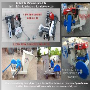
Road Groove Cutter