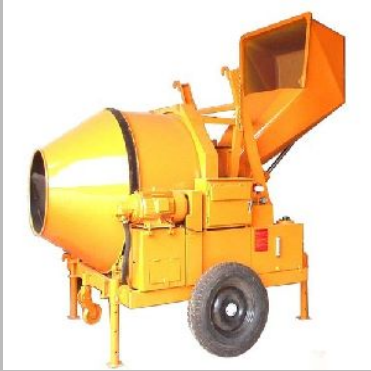
Reversible Concrete Mixture with Hopper