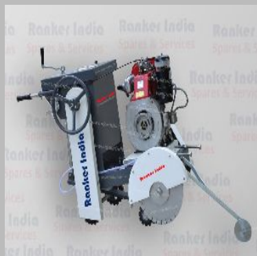
concrete groove cutting machine