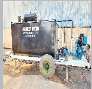
Bitumen Boiler with sprayer