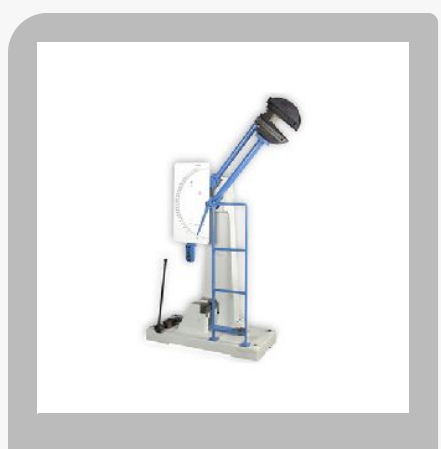
Pendulum Impact Testing Machine