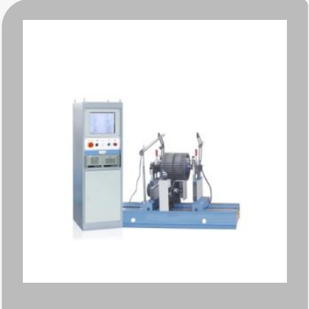
Belt Drive Hard Bearing Balancing Machine