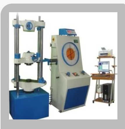
Analog Cum Computerized Universal Testing Machine