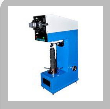
Computerized Vickers Hardness Tester