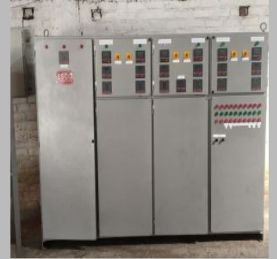
Electrical Control Panel