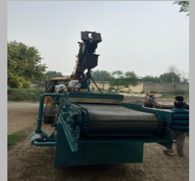
Horizontal Conveyerised Washing Machine