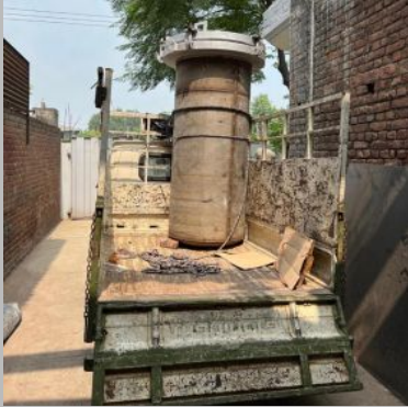
Stainless Steel Round Furnace