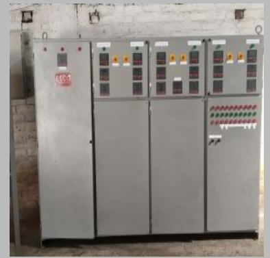
Electrical Control Panel