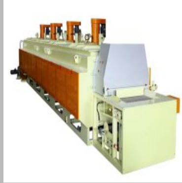
Continuous Tempering Furnace