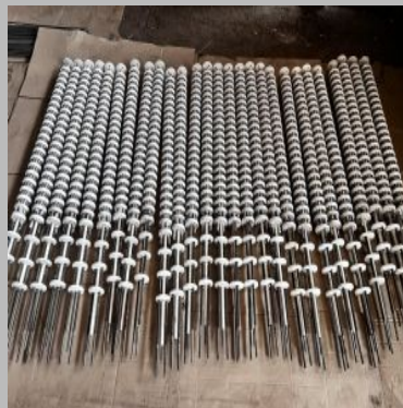
Bundle Rod Heater