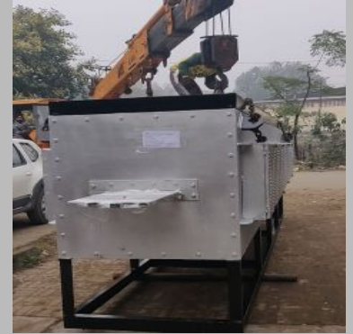
Blade Hardening Furnace