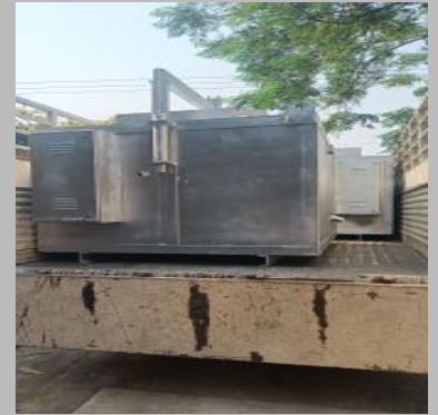
Hot Dip Galvanizing Furnace