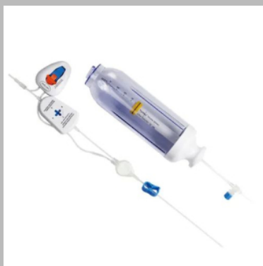
Disposable Infusion Pump