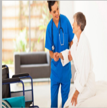
nursing care service