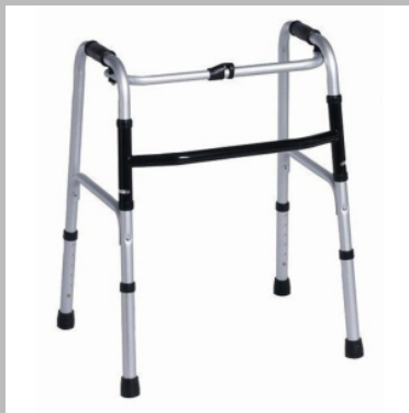
Patient Movable Walker