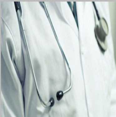
Doctor Visit Services