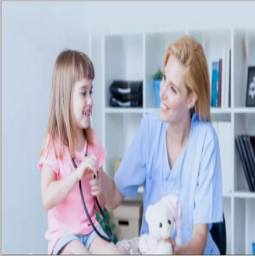
Trained Attendant Services