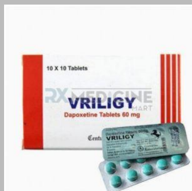
Vriligy 60mg Tablets