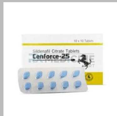
Cenforce 25mg Tablets