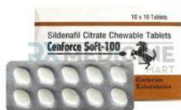
Cenforce Soft 100mg Chewable Tablets