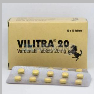
Vilitra 20mg Tablets