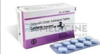
Cenforce Professional Tablets