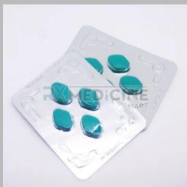
Kamagra 100mg Tablets