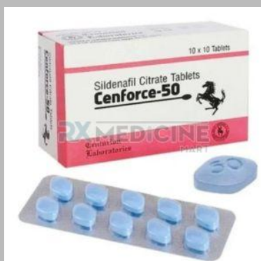
Cenforce 50mg Tablets