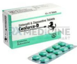
Cenforce D Tablets