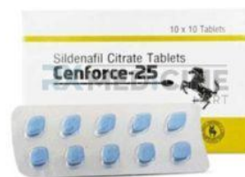
Cenforce 25mg Tablets