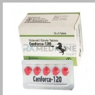
Cenforce 120mg Tablets