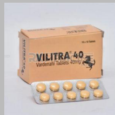
Vilitra 40mg Tablets