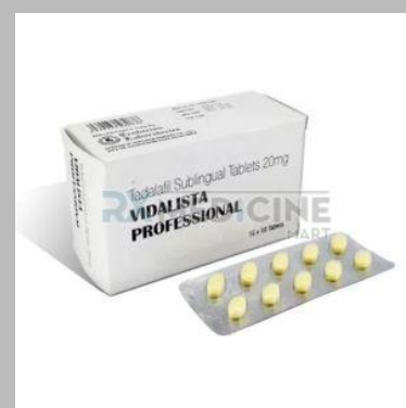
Vidalista Professional Tablets