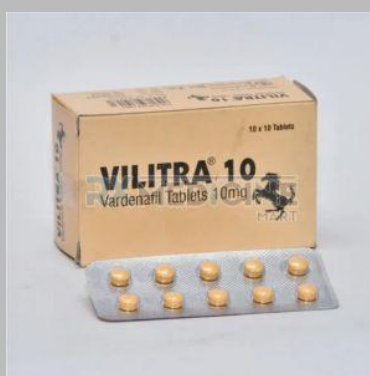
Vilitra 10mg Tablets