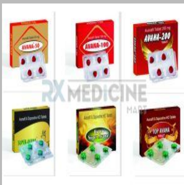
Avana 50/100/200mg Avanafil Tablet