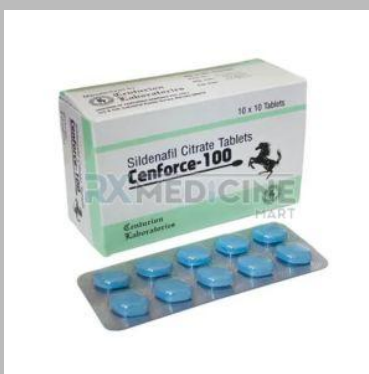
Cenforce 100mg Tablets