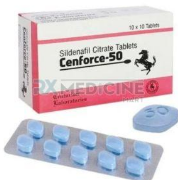
Cenforce 50mg Tablets