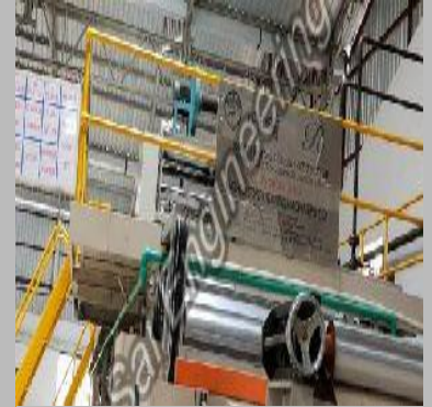
3 Ply Automatic Corrugated Board Plant