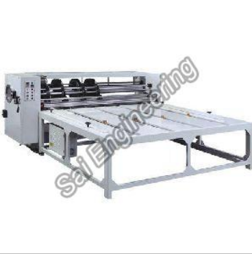
Chain Feeder Combined Rotary Slotter Machine