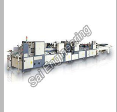
Automatic Folder Gluer Machine