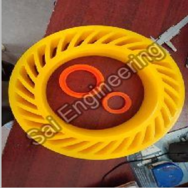
M-002 Lead Edge Feeder Wheel