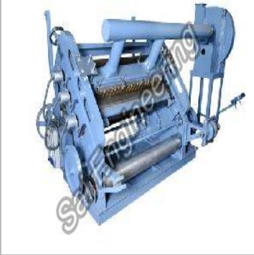
Oblique Type Single Facer Corrugation Machine