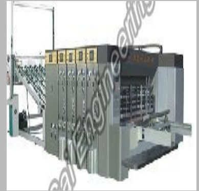
Lead Edge Feeder Flexo Printer Slotter Die Cutter Machine