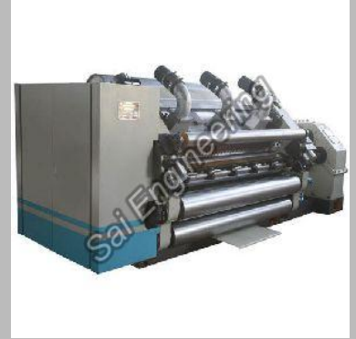
Fingerless Single Facer Corrugation Machine