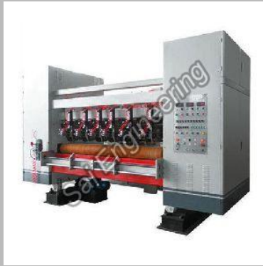
Automatic Thin Blade Slitter Scorer Machine