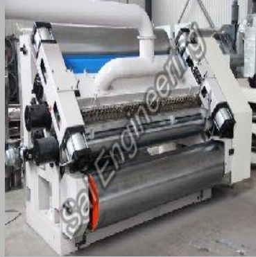
High Speed Fingerless Corrugation Machine