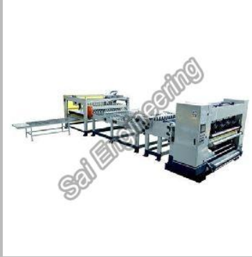
Corrugated Box and Board Making Machine