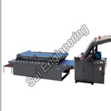
Semi Automatic Flute Laminating Machine