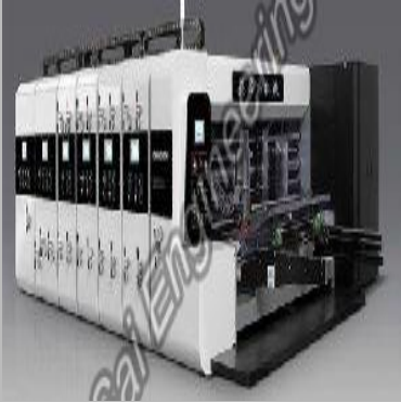
Lead Edge Feeder Flexo Printer Slotter Machine