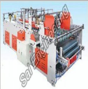
Semi Automatic Folder Gluer With Auto Folding Box