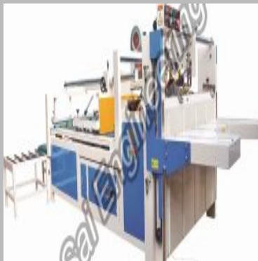
Semi Automatic Folder Gluer Machine