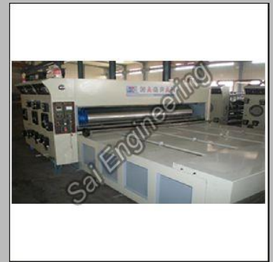
Chain Feed Flexo Printer Slotter Machine