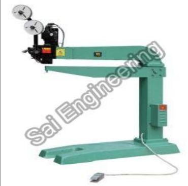
Servo Model Box Stitching Machine