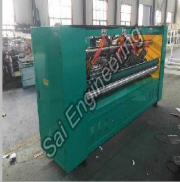
Thin Blade Slitter Scorer Machine