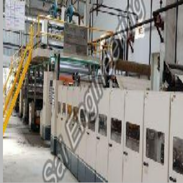
3/5 Ply Automatic Corrugated Box Making Line