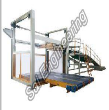
Automatic Paper Splicer