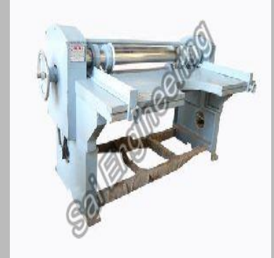
Rotary Cutting Creasing Machine