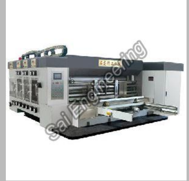
2 Color Flexo Printing Slotter With Leadedge Feeder