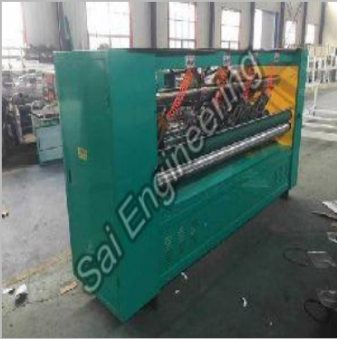
Thin Blade Slitter Scorer Machine

Sai Engineering is known as top Manufacturer, Exporter, Supplier, Retailer, Trader, Distributor, Importer, Buying House and Service Provider of best Automobile Repair Tools & Equipment, corrugated box machine, corrugated box making machine, Corrugated Packaging Boxes & Cartons and Cutting Machine.