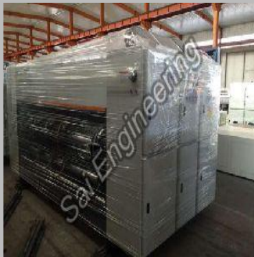
Two Colour Flexo Printer Slotter Machine