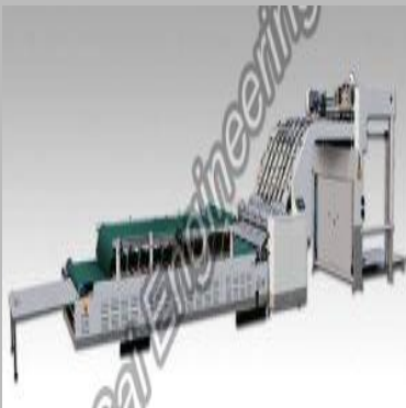
Fully Automatic Flute Laminating Machine