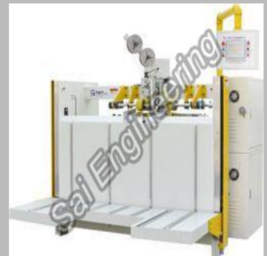
Semi Automatic Box Stitching Machine