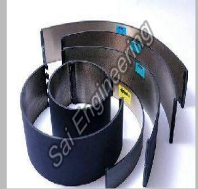
SP00003 Anvil Cover