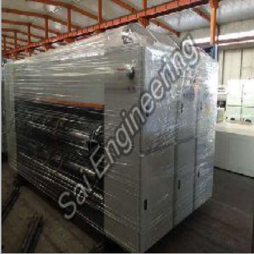
Two Colour Flexo Printer Slotter Machine