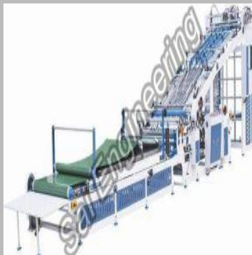
Automatic Flute Laminating Machine