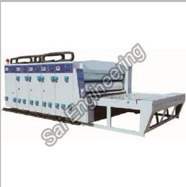
Flexo Printer Slotter Cum Rotary Die Cutting Machine