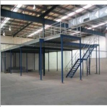
Industrial Mezzanine Floor