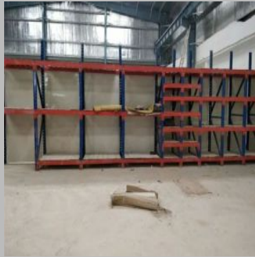
Heavy Duty Pallet Rack