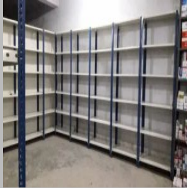
Iron Storage Rack