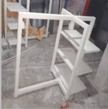
Mall Garments Display Stand