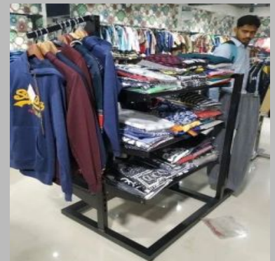
Garment Display Rack