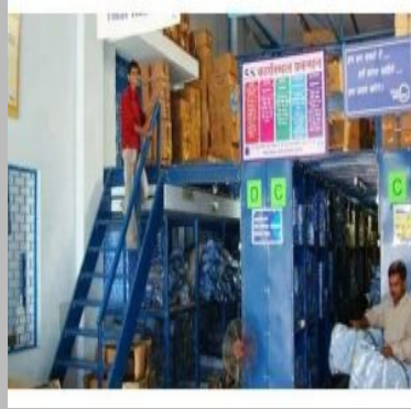
Two Tier Godwon Mezzanine Floor