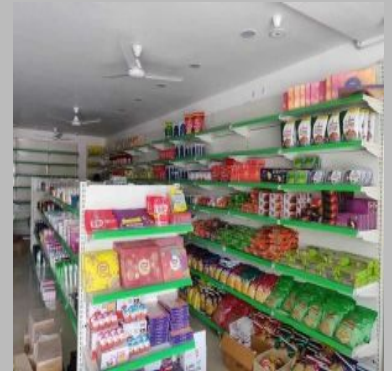
Supermarket Gondola Rack