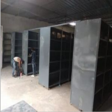
Metal Slotted Angle Rack