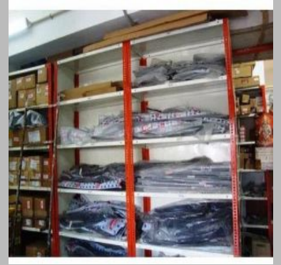
Heavy Duty Metal Shelving Rack