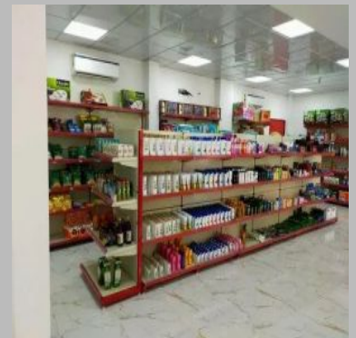
Grocery Store Rack