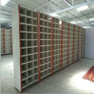
Mild Steel Storage Rack