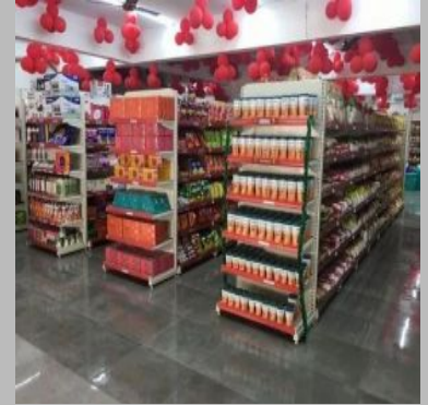
Supermarket Gondola Racks