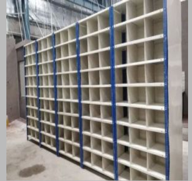
Slotted Angle Pigeon Hole Rack