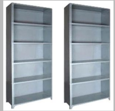
Warehouse Storage Rack