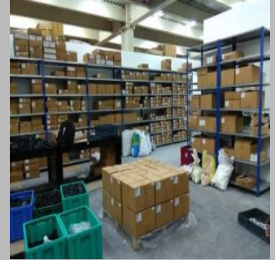
Iron Slotted Angle Rack