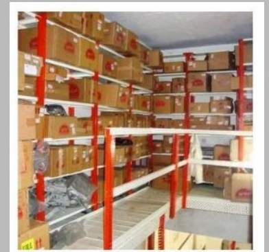
Flooring Storage Rack