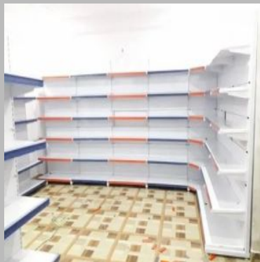
Kirana Store Display Rack