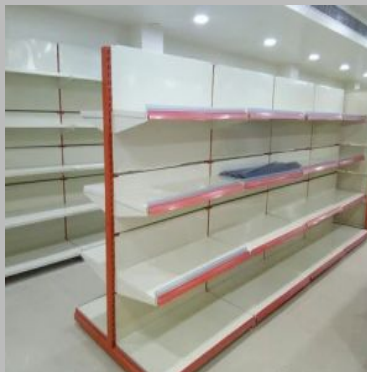
Gondola Display Rack