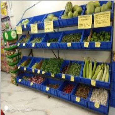
Vegetable Display Rack