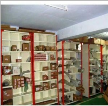
Heavy Duty Storage Rack