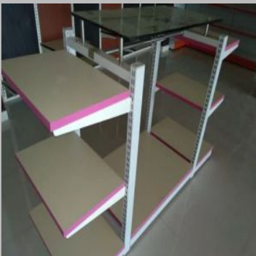
Shirts Display Stand