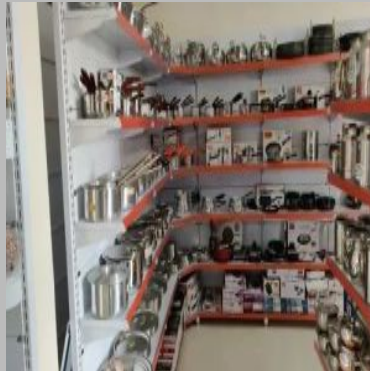
Supermarket Shoes Shelf