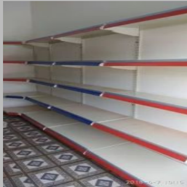
Channel Display Rack