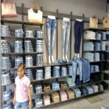
Wall Side Channel Display Rack