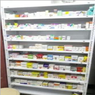
Medical Store Display Rack