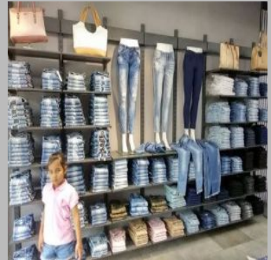
Wall Side Channel Display Rack