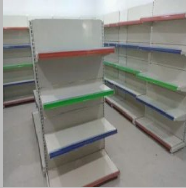
Supermarket Gondola Stand