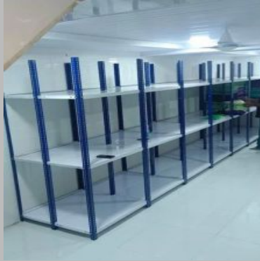
Metal Storage Rack