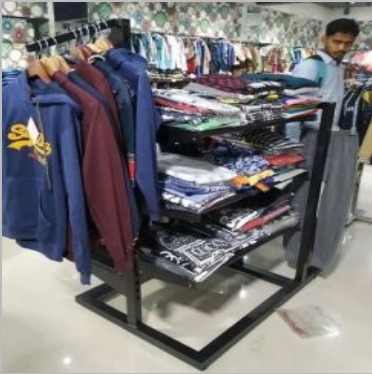
Garment Display Rack