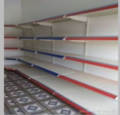
Channel Display Rack