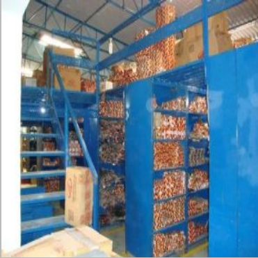
Multi Tier Rack