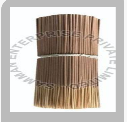
raw incense sticks