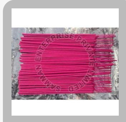
rose incense sticks