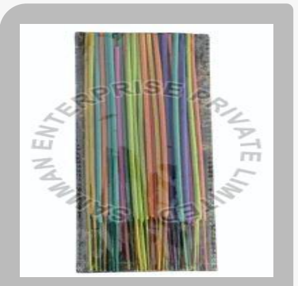
Multicolor Raw Incense Stick