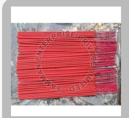
red raw incense sticks