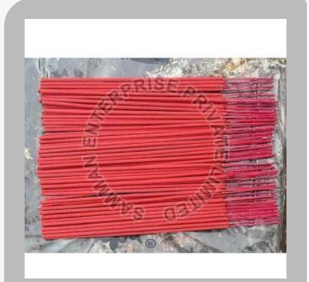
red raw incense sticks