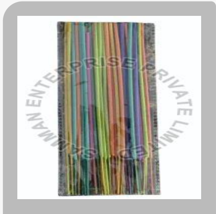
Multicolor Raw Incense Stick