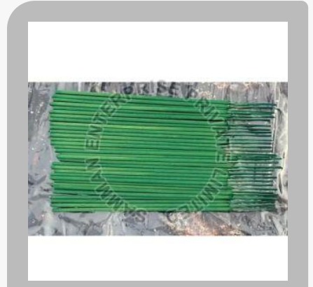
Green Raw Incense Sticks