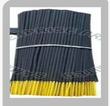
scented incense sticks