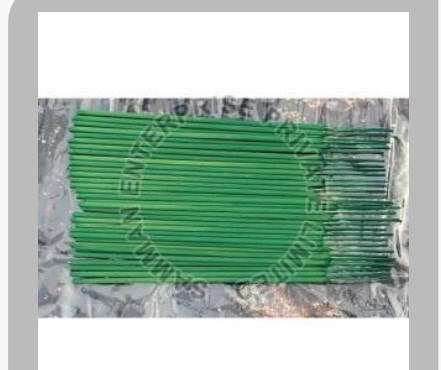
Green Raw Incense Sticks