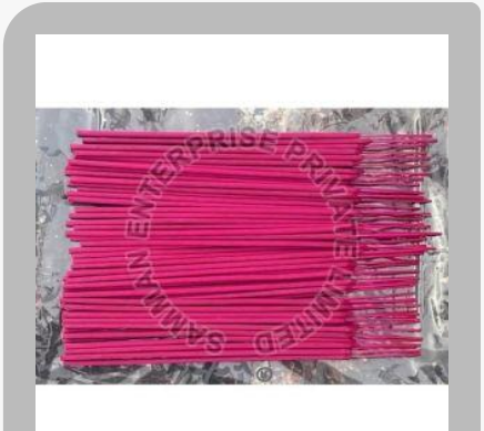
rose incense sticks