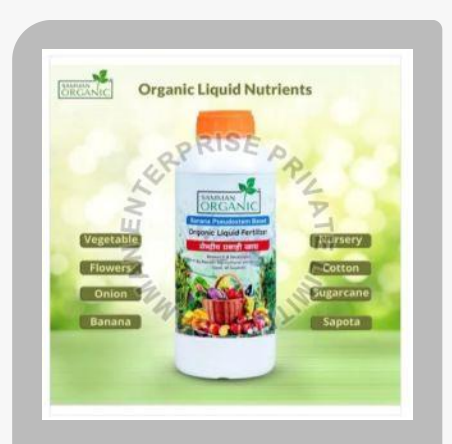
Organic Liquid Fertilizer