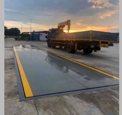
Pit Type Weighbridge