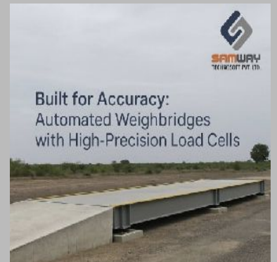
Automated Weighbridge System