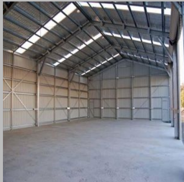
Industrial Structural Fabrication