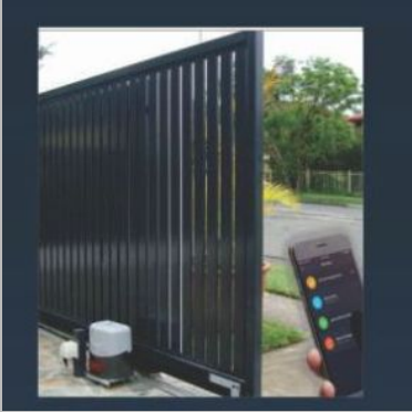
Automatic Sliding Gate Operator

Sanadi Group of Industries is known as top Manufacturer, Exporter, Supplier, Trader, Service Provider and Distributor of best Access Control System, Belt Conveyors, Control Panel Boards, Conveyor Systems and Conveyors.