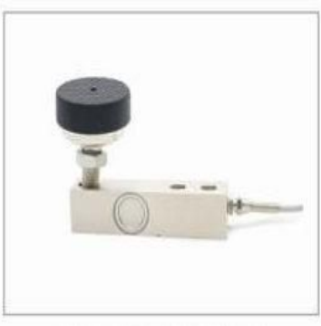
Shear Beam Load Cell