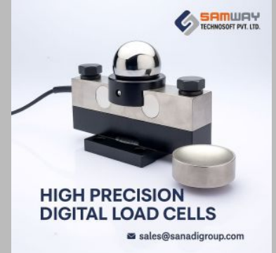
High Precision Digital Load Cell