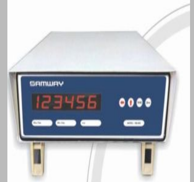
Advance Weighbridge Indicator