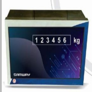
Elite Weighbridge Indicator