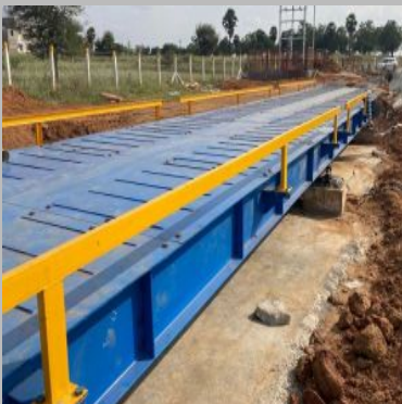
Industrial Weighbridge Structure