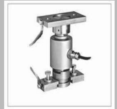
Compression Type Load Cell