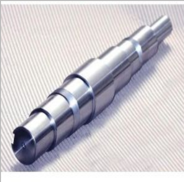
Electric Motor Shaft