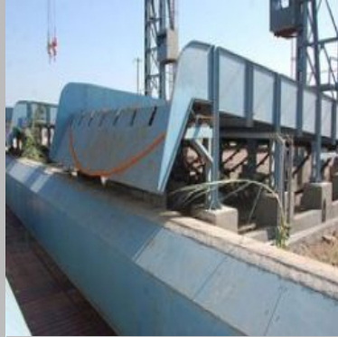
Cane Feeder Table