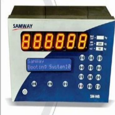
Premium Weighbridge Indicator