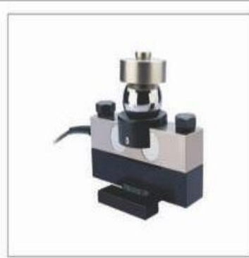
Cup Ball Type Load Cell