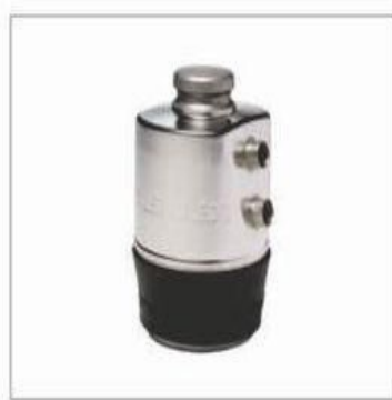
Power Load Cell