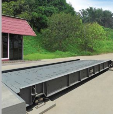
Pitless Type Weighbridge