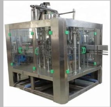
Rinser Filler Copper Head Machine