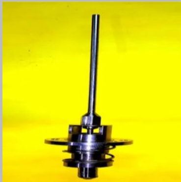
Water Filling Machine PDW Valves