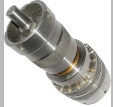
Hilden Type Copper Head Machine