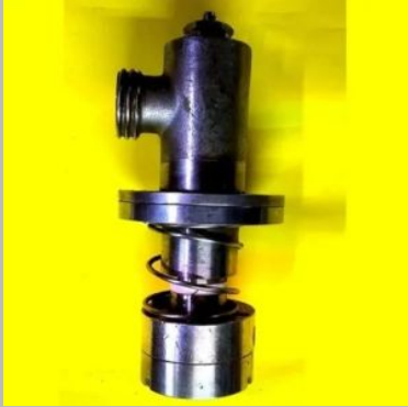
Automatic Water Filling Valve