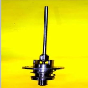
Water Filling Machine PDW Valves