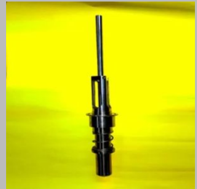
20 Liter PDW Filler Valves