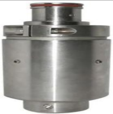
China Type Copper Head Machine