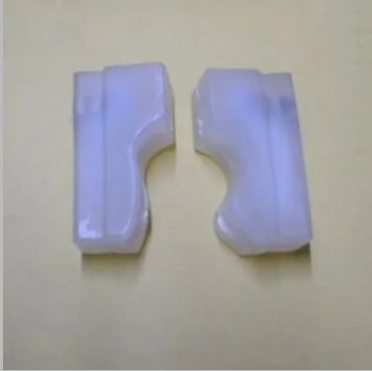
PU Bottle Gripper