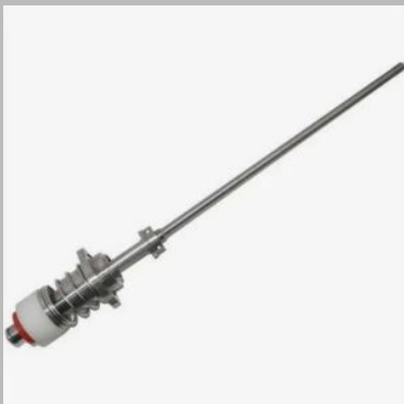
Stainless Steel Filling Valve