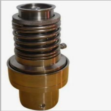
Magnetic Copper Head Machine