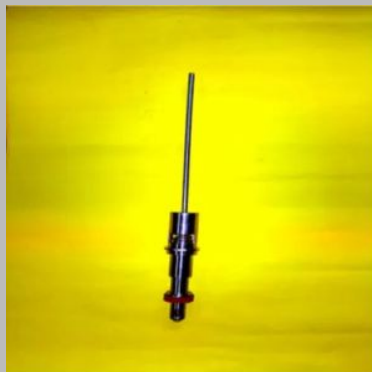
Soda Filling Valve