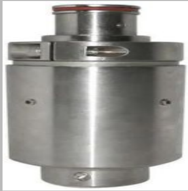
China Type Copper Head Machine