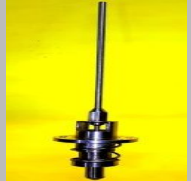
Stainless Steel Water Filling Valve