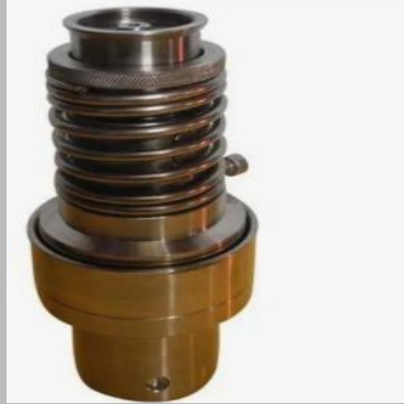
Magnetic Copper Head Machine