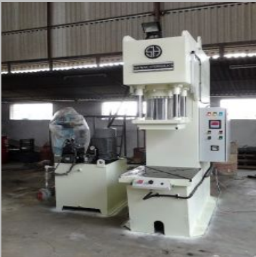
C Type Hydraulic Press Machine