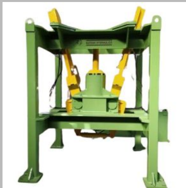
Ingot Stripping Machine