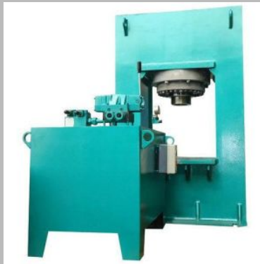
Closed Frame Hydraulic Press Machine