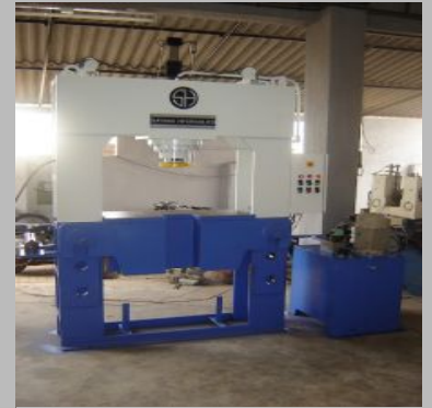
Garage Hydraulic Press