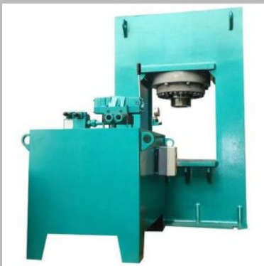
Closed Frame Hydraulic Press Machine