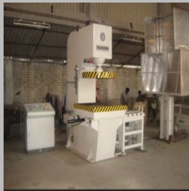
C-frame Hydraulic Press With Sliding Table