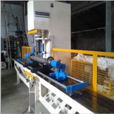
Hydraulic Straightening Press Machine