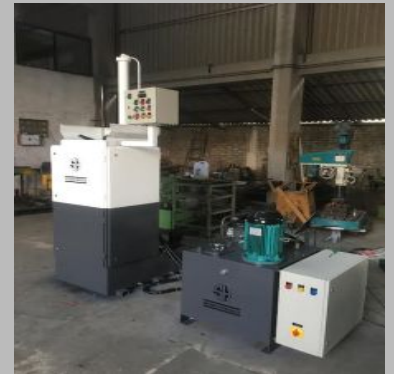
Pull & Push Type Broaching Machine