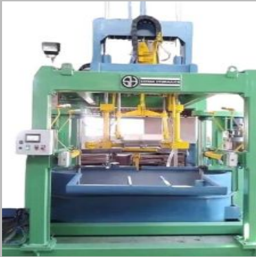
Exothermic Sleeve Forming Machine