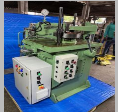
Keyway Broaching Machine