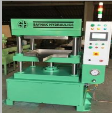
Hydraulic Squeezing Press