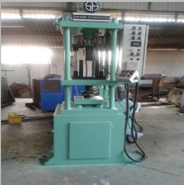
Hydraulic Swaging Machine