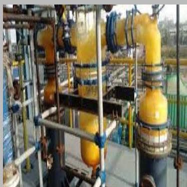
Sulphuric Acid Concentration System