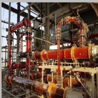
Bromine Recovery Plant