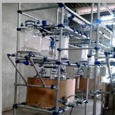
Reaction Distillation Unit