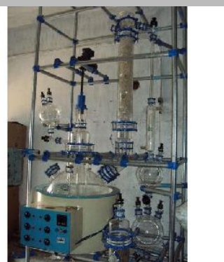
Glass Distillation Unit