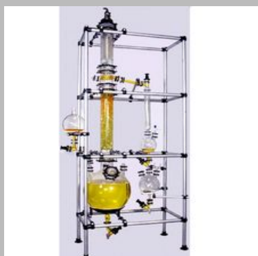
Fractional Distillation Unit