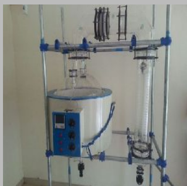
Simple Distillation Unit