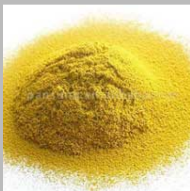
Yellow Iron Oxide Powder