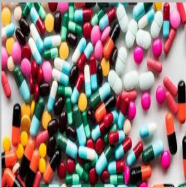
Talc Powder For Pharmaceutical