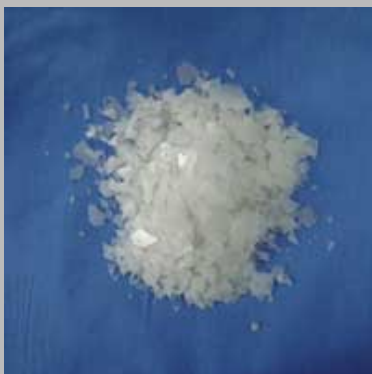
Magnesium Chloride Flakes