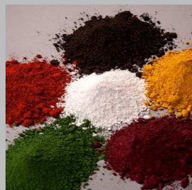
Iron Oxide Powder