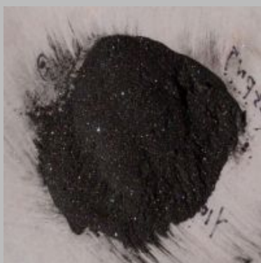
Micaceous Iron Oxide Powder