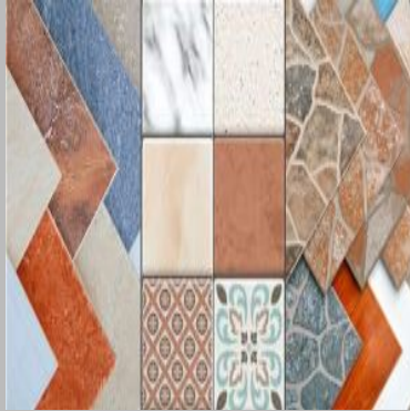
Talc powder in Ceramic Industry