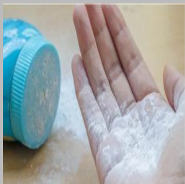
Baby Talcum Powder