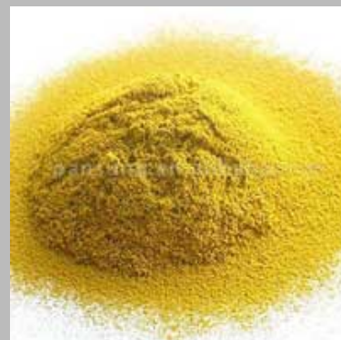
Yellow Iron Oxide Powder