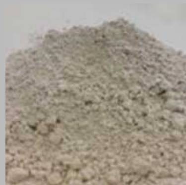
Kaolin China Clay