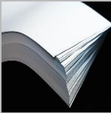
Talc Powder For Paper