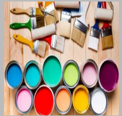
Talc Powder For Paint