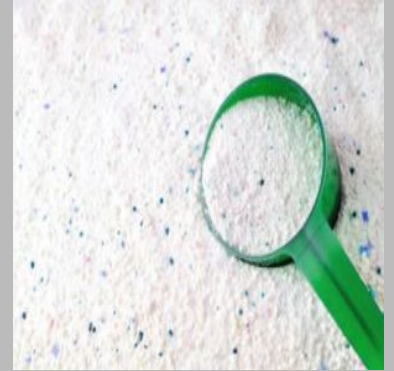
Talc powder for Soaps and Detergents