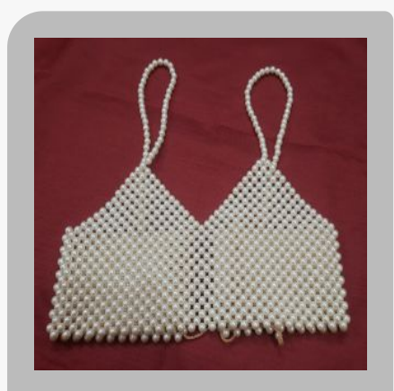
Stylish Beaded Crop Top