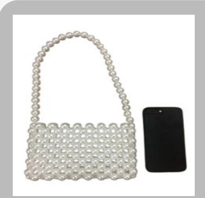
Ladies Beaded Mobile Bag