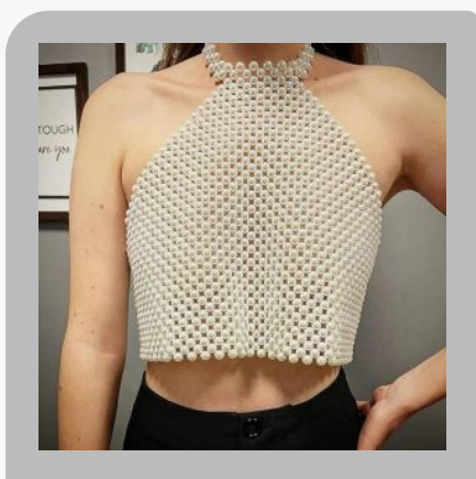
Ladies Designer Beaded Top