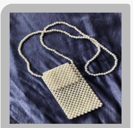
Handmade Beaded Sling Bag