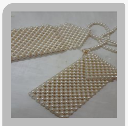
Pearl Beaded Sling Bag