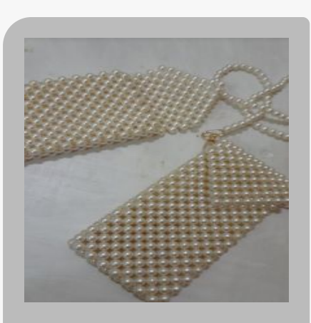
Pearl Beaded Sling Bag