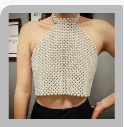
Ladies Designer Beaded Top