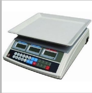
Digital Weighing Scale