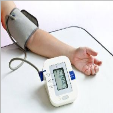
Digital Blood Pressure Monitor

We Shreenathji Medical Agency are a leading and distinguished Manufacturer and Distributor of quality Apron, Bed Linen & Bedspreads, Bicycles, Bicycles Parts and Accessories, Blood Pressure Machine and Body Masks.