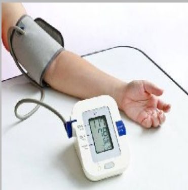
Digital Blood Pressure Monitor