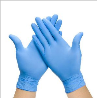
Sterile Disposable Surgical Gloves