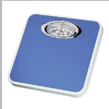
Manual Weighing Scale