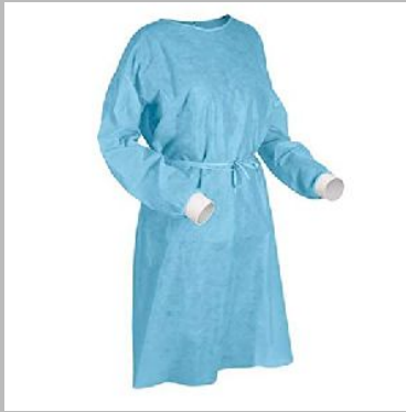
Disposable Surgical Gown