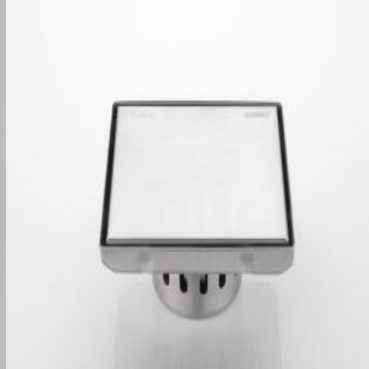
SS 304 Tiles Insert 6x6 Floor Drain