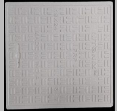
FRP Rectangular Manhole Cover