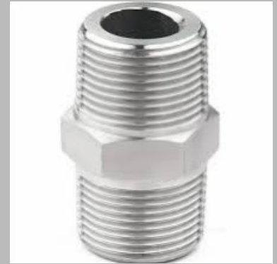
Hex Nipples SS 202