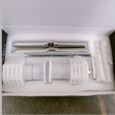
kohler wash basin