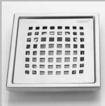
SS 304 Floor Traps