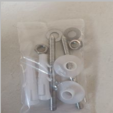
SS Wash Basin Screw