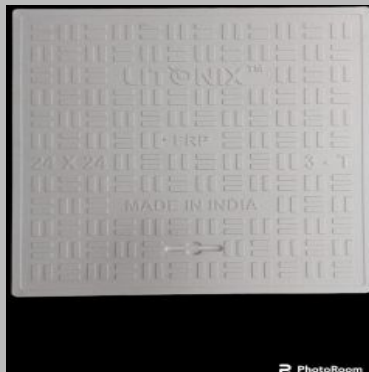
24X24 FRP MANHOLE COVER