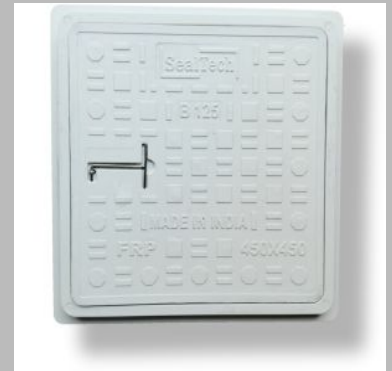
450X450 Heavy Duty FRP Manhole Cover