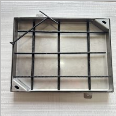
MS Recessed Manhole Cover