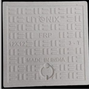
FRP Manhole Cover