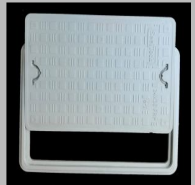
24X36 FRP Manhole Cover