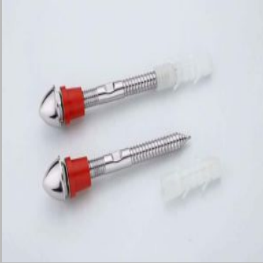
Rack Bolt Screw