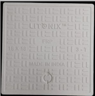
FRP Square Manhole Cover