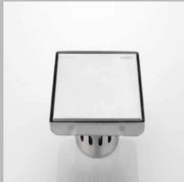
SS 304 Tiles Insert 6x6 Floor Drain