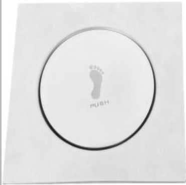
POP-up Round Square SS Floor Drain