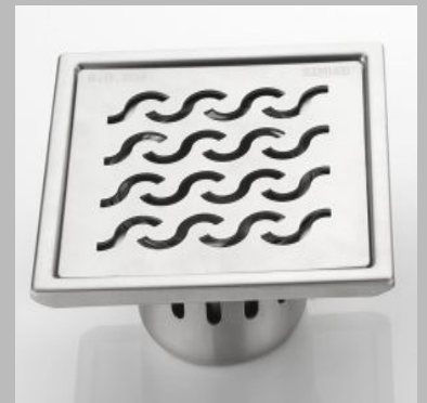
Stainless Steel Floor Trap