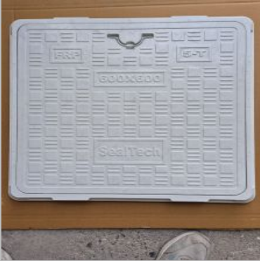
BMC/DMC MANHOLE COVERS