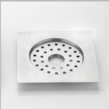
Square Locking Floor Jali