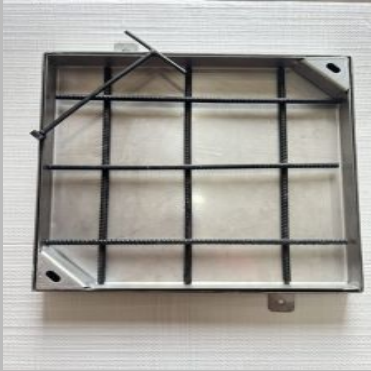
SS 304 Recessed Cover Heavy Duty