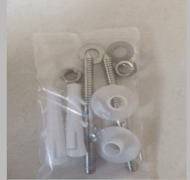
MS RACK BOLT