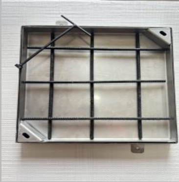
MS Recessed Manhole Cover