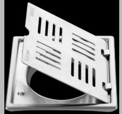
Stainless Steel 304 SS Hinge Floor Trap