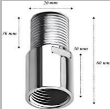
CP Extension Nipples SS202