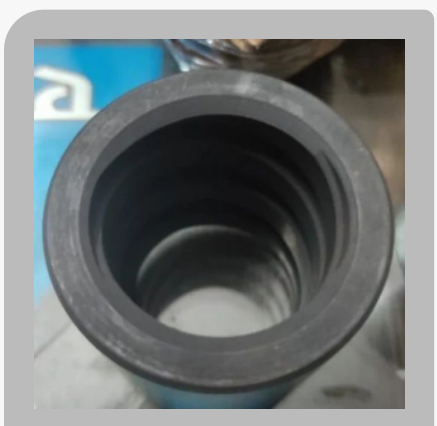
Spiral Carbon Bush