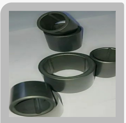
Self Lubricating Carbon Bush