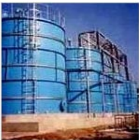
FRP Storage Tanks