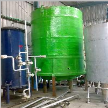
Conical Bottom FRP Tank