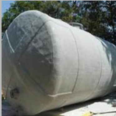
FRP Acid Storage Tank