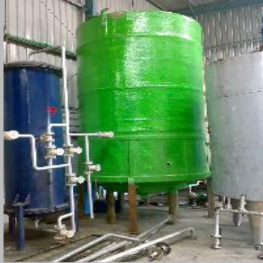
Conical Bottom FRP Tank