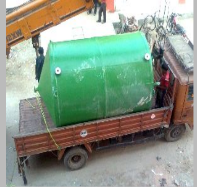
Food Grade FRP Tank