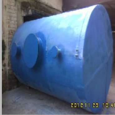
FRP Sewage Tank