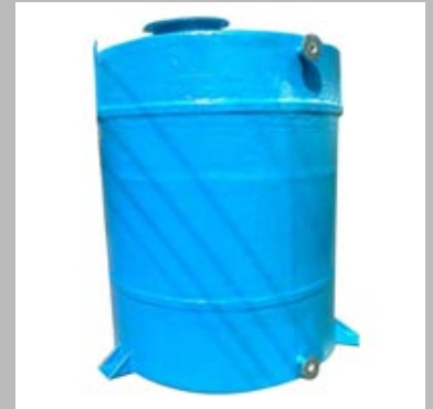
HCL Storage Tank