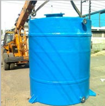
PP FRP Storage Tank