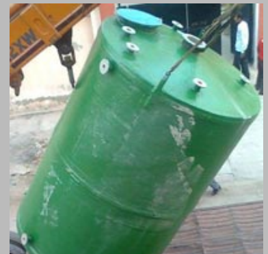
Chemical Storage Tank