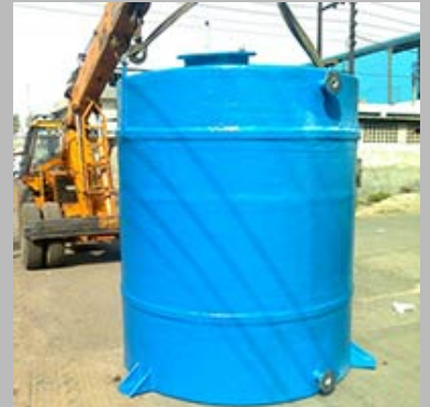
PP FRP Storage Tank