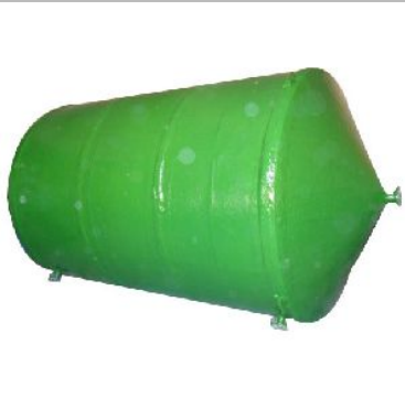
Sulfuric Acid Storage Tanks