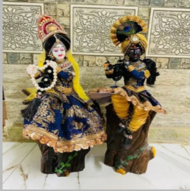
Polyresin Tree Radha Krishna Statue