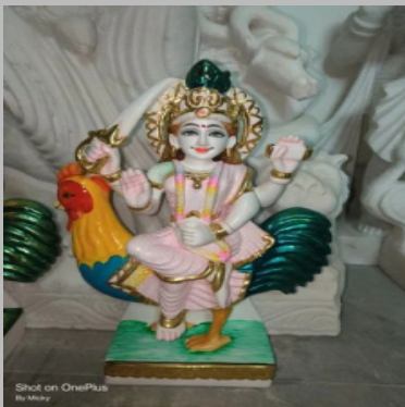
Marble Murgan Devi Statue