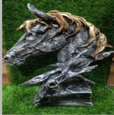
Resin Horse Head Sculpture