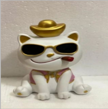
Resin Smoking Cat Sculpture