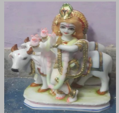
Marble Krishna With Cow Statue