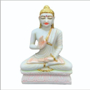
White Marble Gautam Buddha Statue