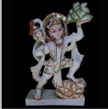
White Marble Hanuman Statue