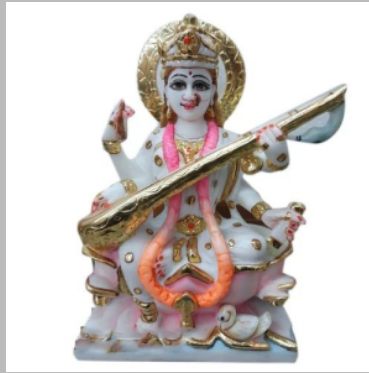
9 inch Marble Saraswati Maa Statue