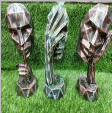
Polyresin Men Face Statue