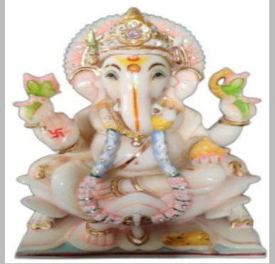
9 Inch White Marble Ganesh Statue