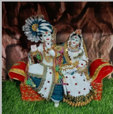
Polyresin Radha Krishna Statue