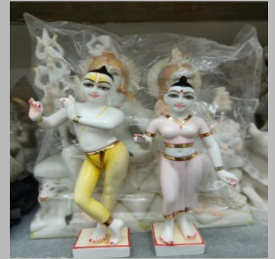
Marble Radha Krishna Iskon Statue