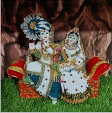
Polyresin Radha Krishna Statue