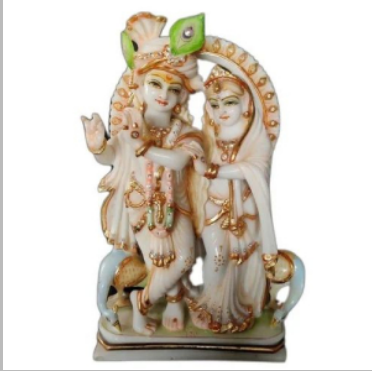
White Marble Radha Krishna Statue