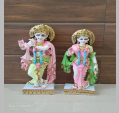
Painted Marble Radha Krishna Statue