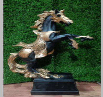
22 Inch Resin Horse Sculpture