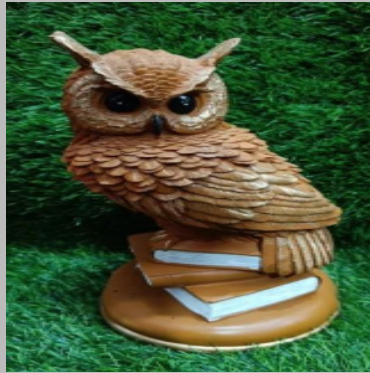
Resin Owl Statue