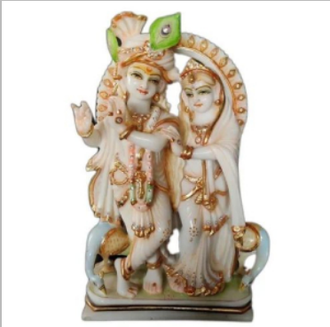
White Marble Radha Krishna Statue