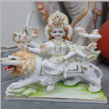
White Marble Maa Durga Statue