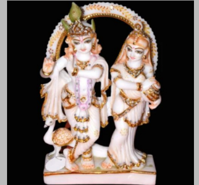
12 Inch White Marble Radha Krishna Statue