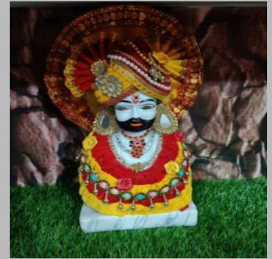
Polyresin Shyam Baba Statue