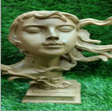
resin lady face