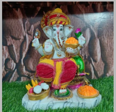
Polyresin Ganesh Statue