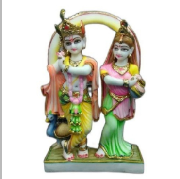
Multicolor 12 Inch Marble Radha Krishna Statue