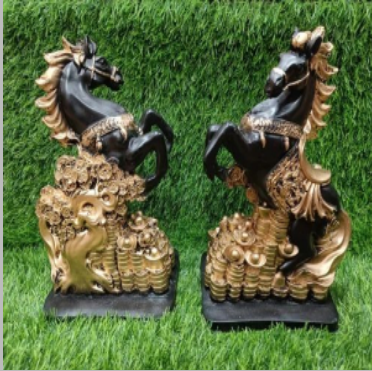
10 Inch Resin Horse Sculpture