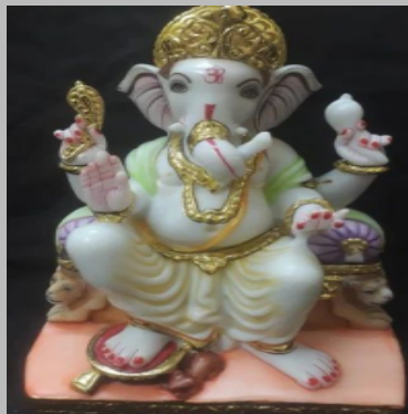
Marble Lal Bag Ganesh Statue