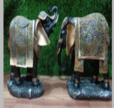
Resin Elephant Sculpture