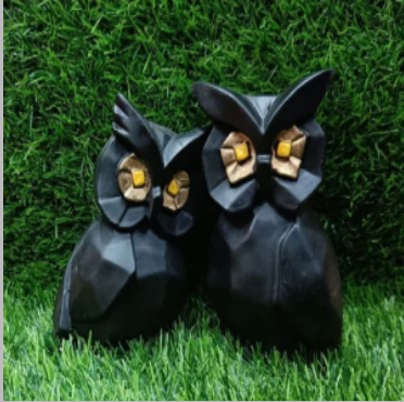
Resin Owl Couple Sculpture