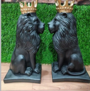
Resin Lion Sculpture