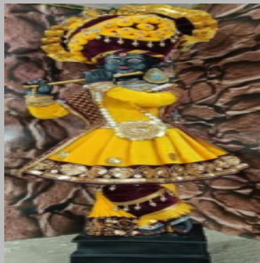
Polyresin Black Krishna Statue