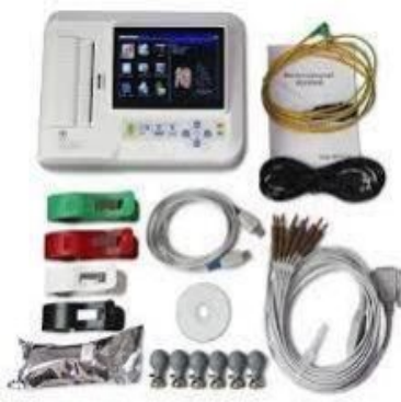
6 Channel ECG Machine