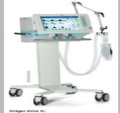
Dräger Evita XL Ventilator