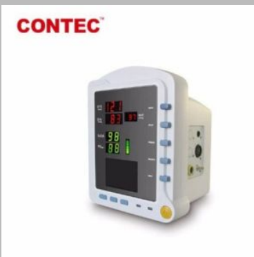
CMS 5100 Contec Medical Monitor