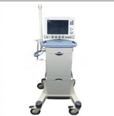
Maquet Servo I Ventilator