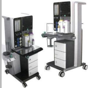
Asteros Royale Vent Anaesthesia Delivery System