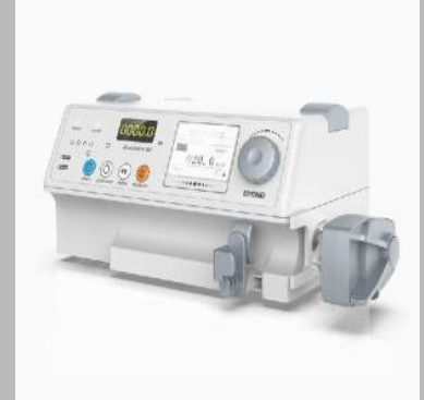
Beyond Syringe Pump