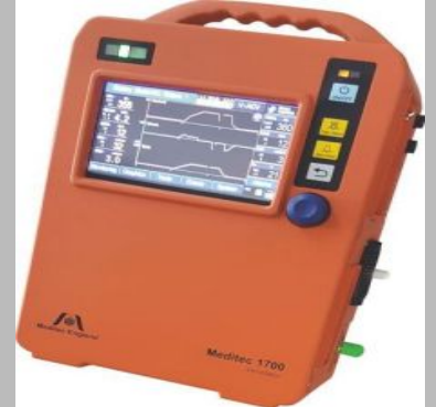
Meditec England Ventilator