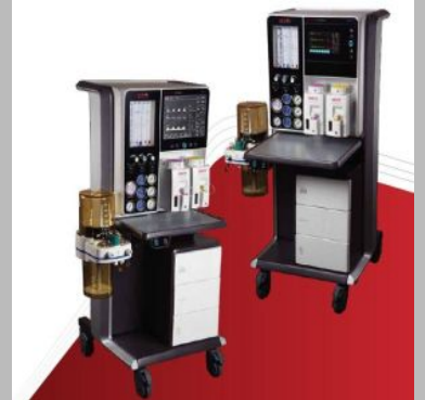
Asteros Royale Class 2 Anaesthesia Delivery System