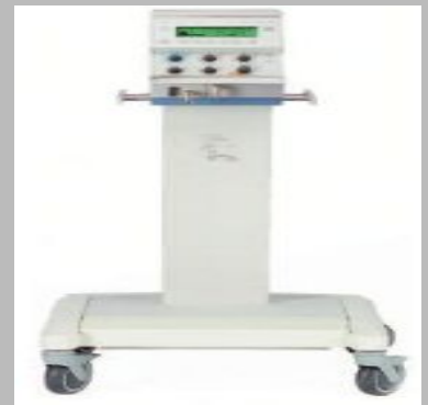
Babylog 8000 Plus Refurbished Ventilator