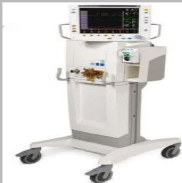
GE Engstrom Ventilator