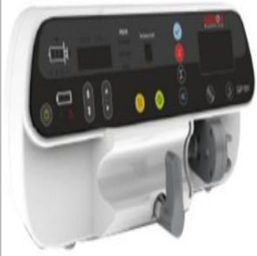
Medion Healthcare Syringe Pump