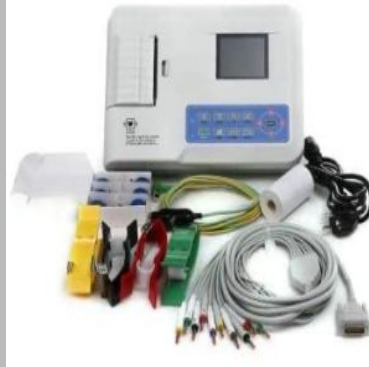
3 Channel ECG Machine