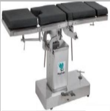
Operation Theatre Table