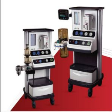
Astros Lite Anaesthesia Delivery System