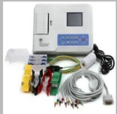
3 Channel ECG Machine