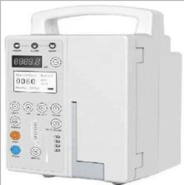
Beyond Infusion Pump