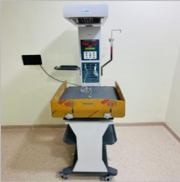
Infant Radiant Warmer

SILICON MEDITECH PRIVATE LIMITED is known as top Manufacturer, Exporter, Supplier, Retailer, Trader and Distributor of best Computer Monitor, ECG Accessories, ECG Machine, Electrical & Electronic Testing Devices and Medical Equipment.