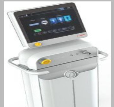
Altima Intensive Care Ventilator