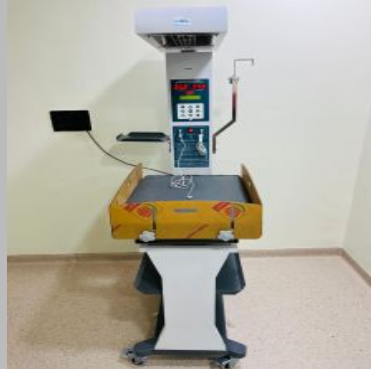
Infant Radiant Warmer