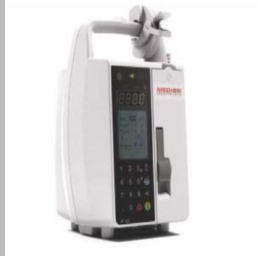
Medion Healthcare Infusion Pump