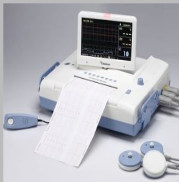
Bistos Fetal Monitor