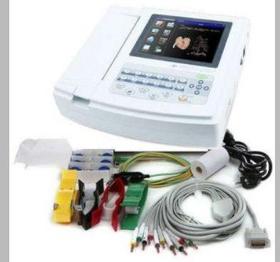
12 Channel ECG Machine