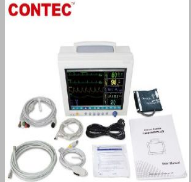
CMS 7000 Contec Medical Monitor