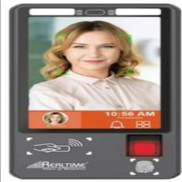
Realtime T503F L1 Face Aadhaar Based Attendance