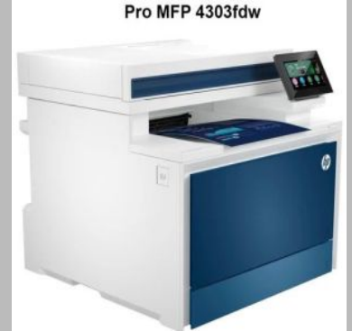
HP Color Laserjet PRO Mfp 4303fdw Printer