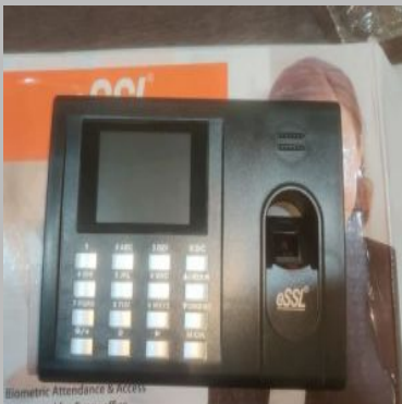
Essl K 30 PRO Biometric Attendance System