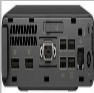
HP Tiny 8th Gen Mini PC