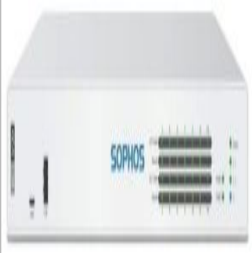
Sophos Xgs Series Firewall Network Security Device