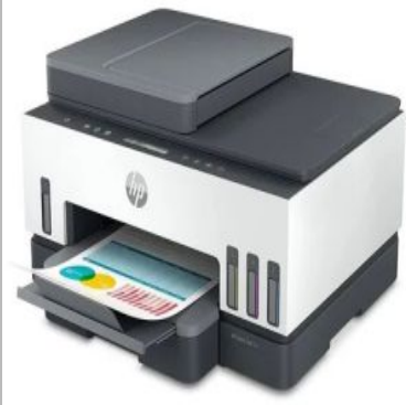
HP Smart Tank 750 Wi Fi All-in-One Printer