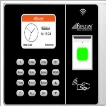
Realtime RS9N Attendance Biometric System