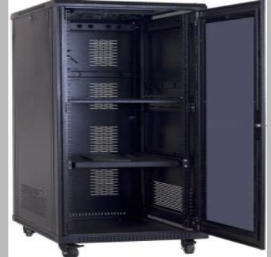
Mild Steel 27U Floor Standing Network Rack