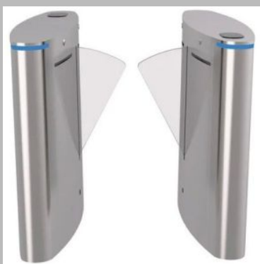
Essl FBE1000 Single Lane Flap Barrier