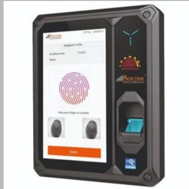
Realtime T502L Aadhaar Enabled Biometric Attendance System