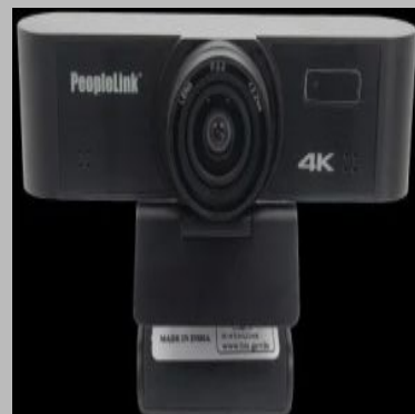
Peoplelink Eagle 4k Web Camera