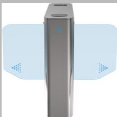
Essl SB-ES-3216 Single Lane Swing Barrier