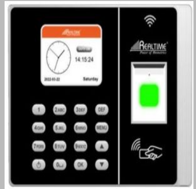
Realtime RS9W Fingerprint Card Attendance System