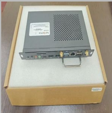
Core i7 Ops Mini PC