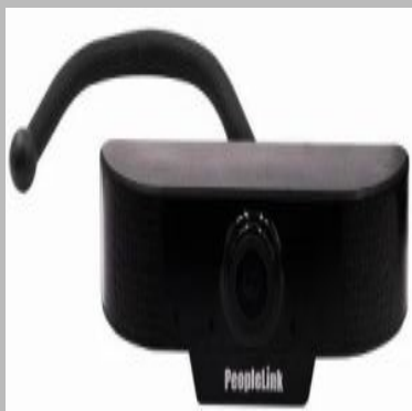
Peoplelink Nebula C30 Conference CAM