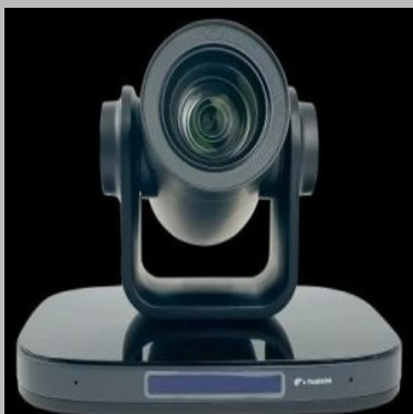
Peoplelink Elite 4k 12x Conference Camera