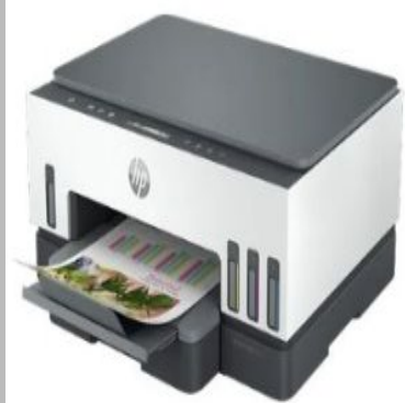
HP Smart Tank 720 Wi Fi All-in-One Printer