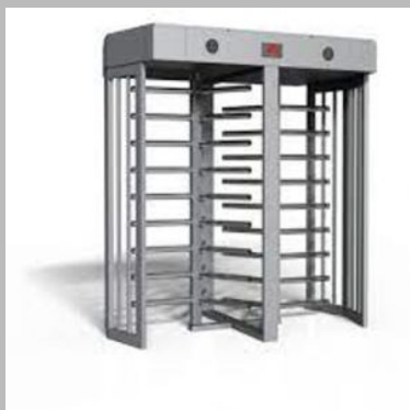
Robust Mild Steel Full Height Turnstile