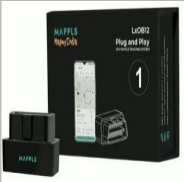
LxOB12 Four Wheeler Vehicle GPS Tracker