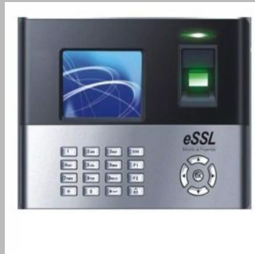
Essl X990 Standalone Biometric Fingerprint Time Attendance System