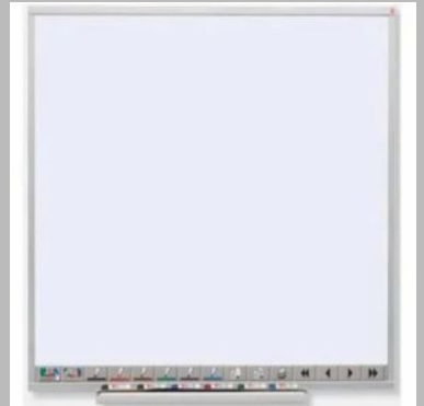
Interactive Flat Panel (Cover )