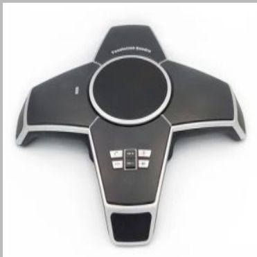
Peoplelink Quadro Hybrid Conference Phone