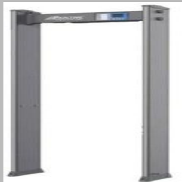
Realtime RSS003 Door Frame Metal Detector