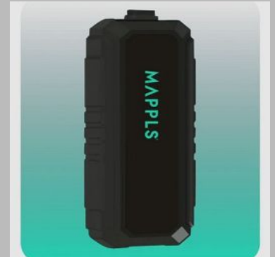
LX15 Vehicle GPS Tracker