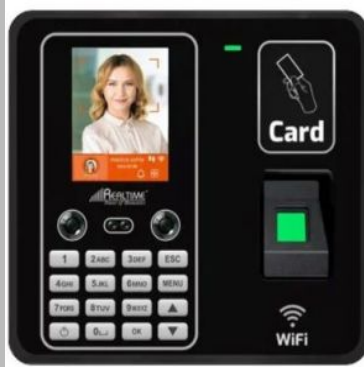
Realtime T304 Mini Biometric Machine