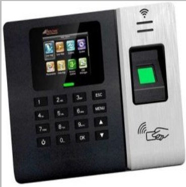
Realtime RS20 Plus Biometric Attendance System