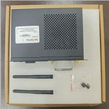
Ops For Interactive Panel