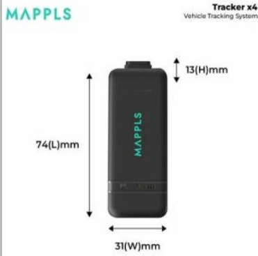
X4 Tracker Vehicle GPS Tracker