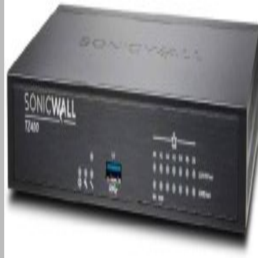
Sonicwall Firewall Tz400 Network Security Device