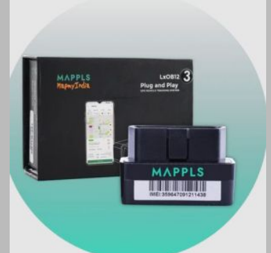
LXOB12 Four Wheeler Vehicle GPS Tracker