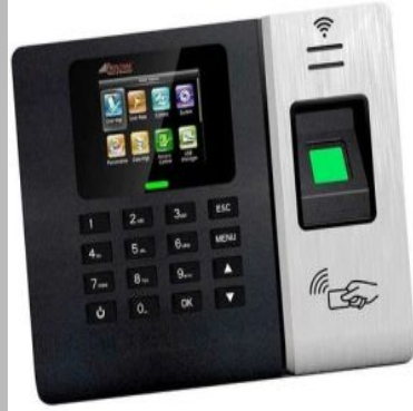
Realtime RS20 Plus Biometric Attendance System