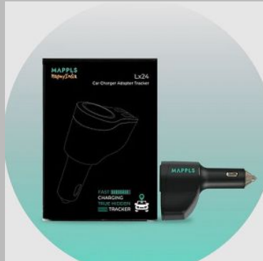
LX24 Vehicle GPS Tracker