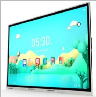
86 Inch Samsung Interactive Panel