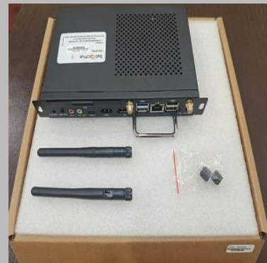
Core i5 Ops Mini PC