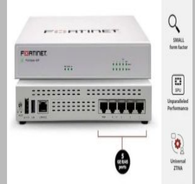
Fortinet Fortigate FG-40F Network Security Device