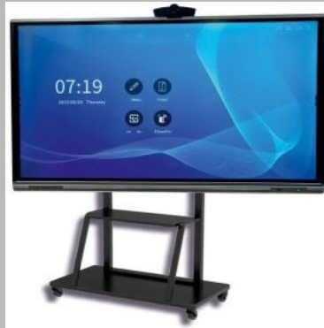
Interactive Flat Panel