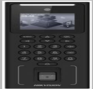
DS- K1T321 Series Hikvision Biometric Attendance System