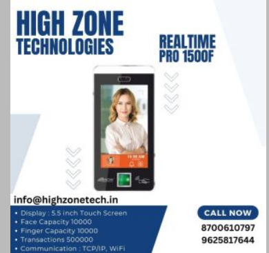
Realtime PRO 1500F Attendance System