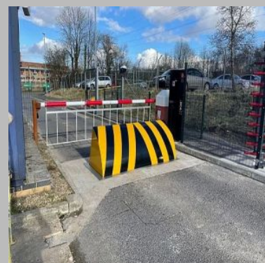
Automatic Road Blocker