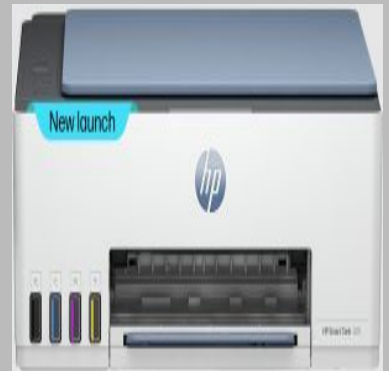
HP Smart Tank 525 All in One Printer