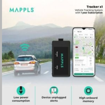
Tracker X1 Vehicle Mapple GPS Tracker