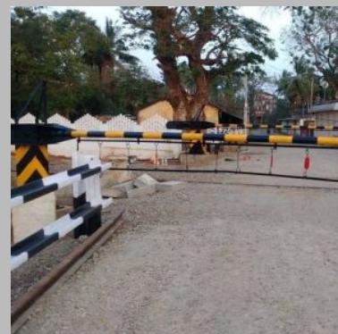
Railway Crossing Barrier Gate