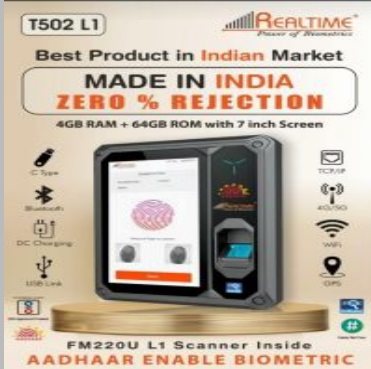
Realtime T 502 I1 Biometric Attendance Machine

We Sirion Tech Enterprises are a leading and distinguished Supplier and Distributor of quality Automatic Doors, Automatic Gate, Biometric Access Control Systems, Biometric Attendance Machine and Biometric Attendance System.