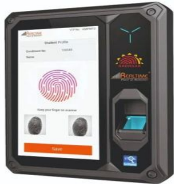
Realtime T502L1 Aadhaar Based Attendance System