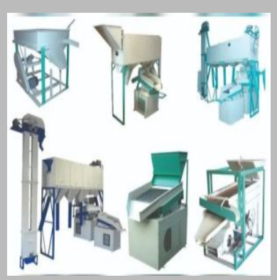
Semi Automatic Destoner Cum Grader