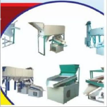
All type seeds grinding machine MFG