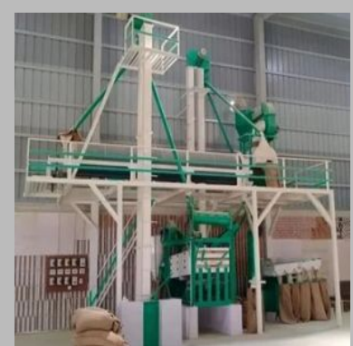
20 TPH Gravity Separator Machine