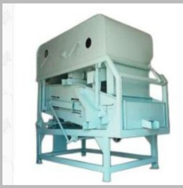
5 TPH Seed Cleaning & Grading Machine