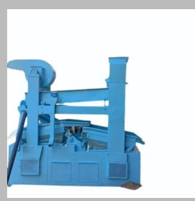
5 HP Multiseed Grader Machine