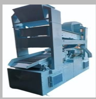
Seed Grading Machine