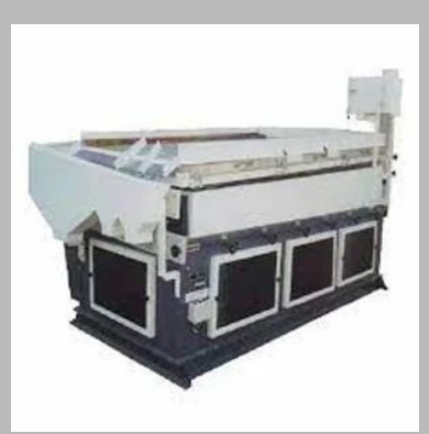
Gravity Separator Machine