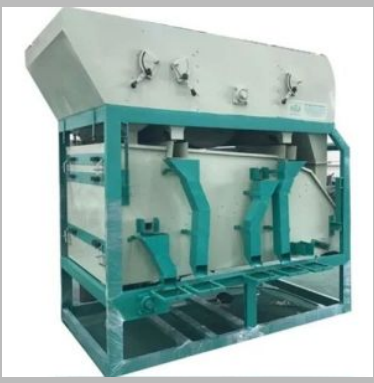
Automatic Seeds Cleaning Machine