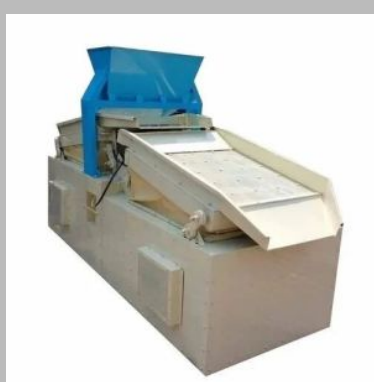
3 HP Rice Double Destoner Machine