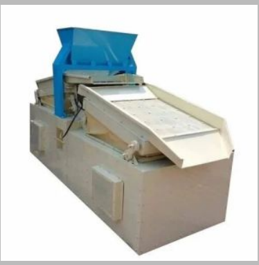
5 TPH Seed Cleaning Machine