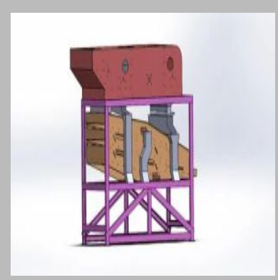
5 HP Multigrain Grading Machine