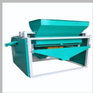
420 V Magnetic Destoner Machine