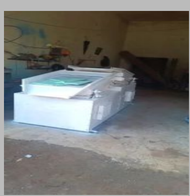
Mild Steel Double Destoner Machine