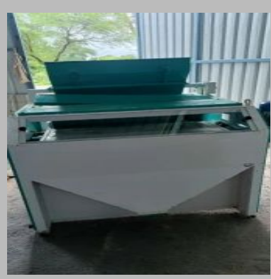
Three Phase Magnetic Destoner Machine