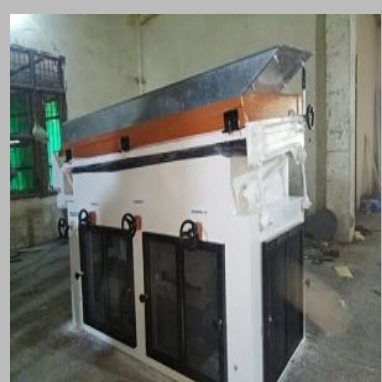
Mild Steel Gravity Separator Machine