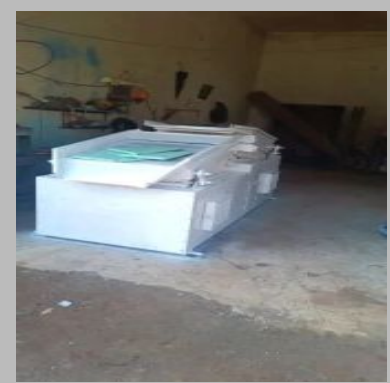
Mild Steel Double Destoner Machine