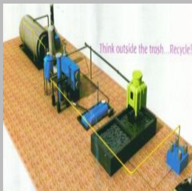
Scrap Tyre Pyrolysis Plant Consultancy Services

We SMB Environmental Projects (P) Ltd. are a leading and distinguished Service Provider, Manufacturer, Exporter and Supplier of quality Business Consultant, chemical n process industries, food processing industries, hardware n engg industries and Pharmaceutical Industries.