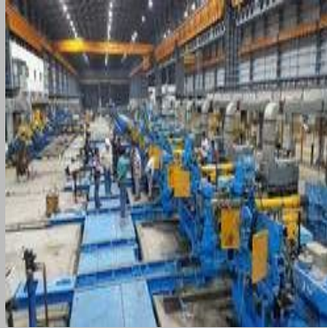
Re-Rolling Mill Project Consultancy Services