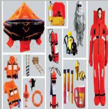
Project Report for Starting Ship Schandling Business