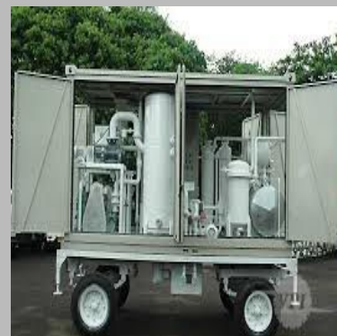
Transformer Oil Filtration Unit Consultancy Services