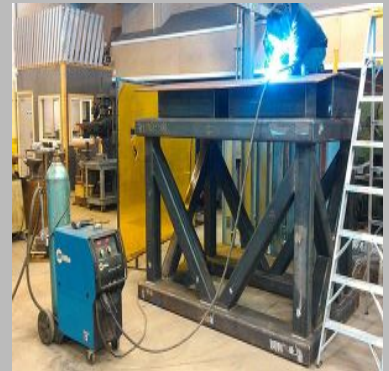
Fabrication Workshop Project Consultancy Services