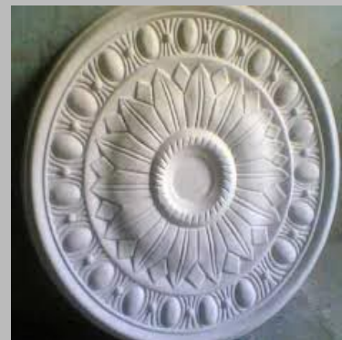
Plaster OF Paris Project Consultancy Services