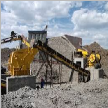
Stone Crusher Project Consultancy Services