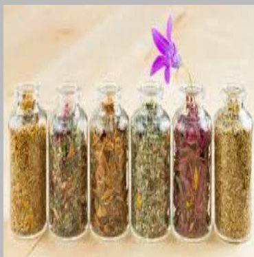
Herbal Medicine Project Consultancy Services