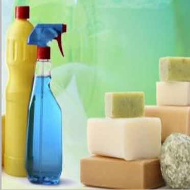
Soaps and Detergents Making Project Consultancy Services