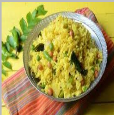
Poha Manufacturing Project Consultancy Services