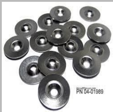
MS Washer Nut Bolts Etc Making Project Consultancy Services