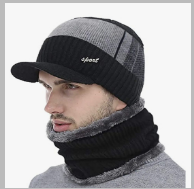
Mens Winter Cap with Neck Warmer