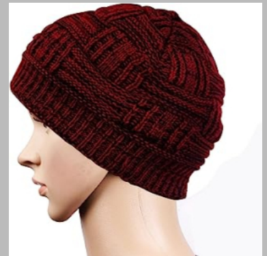
Unisex Skull Woolen Cap