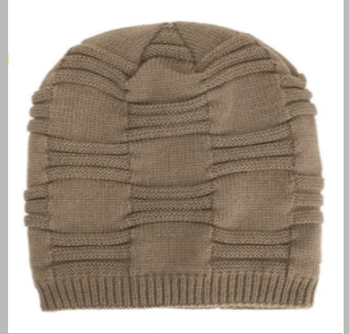
Unisex Weave Warm Woolen Cap