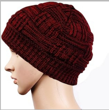
Unisex Skull Woolen Cap