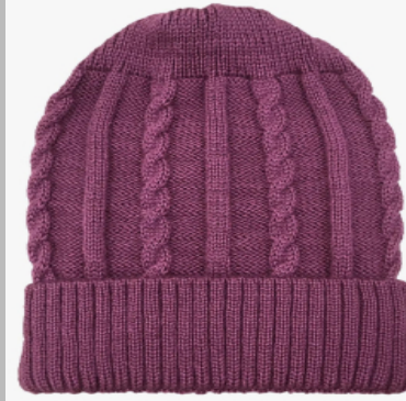
Mens Beanie Winter Cap