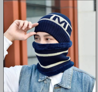
Mens Beanie Hat Scarf Set