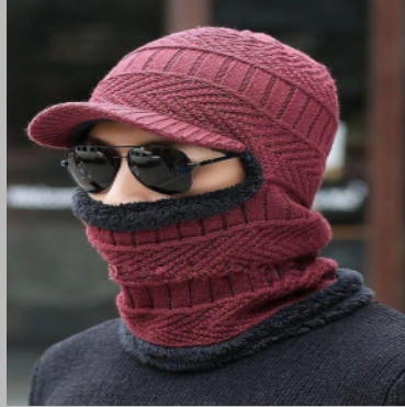
Unisex Woolen Cap with Neck Warmer