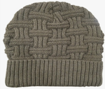
Mens Knitted Winter Cap