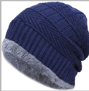
Mens Woolen Winter Cap