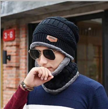
Woolen Beanie Hat Neck Warmer Cap