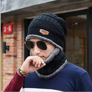
Woolen Beanie Hat Neck Warmer Cap