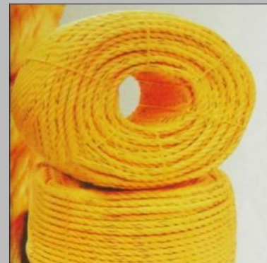
Garware Nylon Industrial Rope