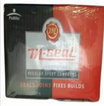
Pidilite M Seal