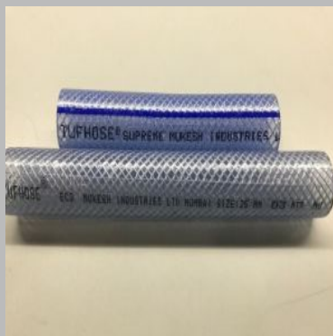
PVC Nylon Braided Hoses