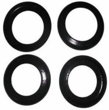
Rubber O Rings