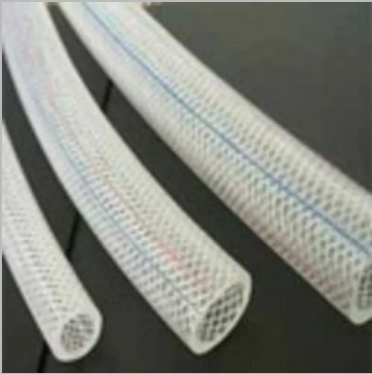
Nylon Braided Hose Pipe

We Soham Industries are a leading and distinguished Supplier, Retailer, Trader and Distributor of quality Abrasive Products, Adhesive & Non-Adhesive Tapes, Adhesives, Adhesives & Sealants and Apron.