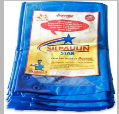
Supreme Nylon Silpaulin Waterproof Tarpaulins