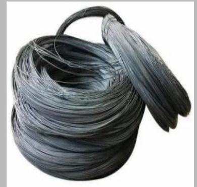
Mild Steel Binding Wire