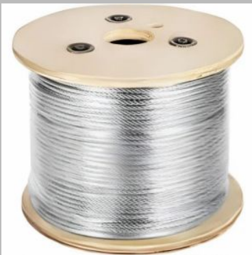
Stainless Steel Wire Rope