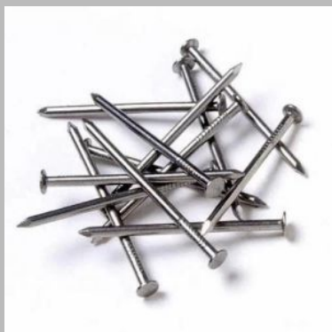
Industrial Chamber Nails