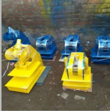
Manual Sole Cutting Machine