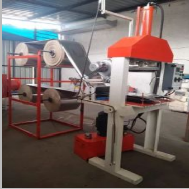
Single Die Paper Plate Making Machine