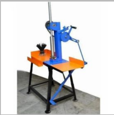
Manual Agarbatti Making Machine