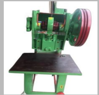
15 Ton Sole Cutting Machine