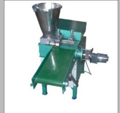
dhoop batti making machine