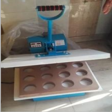
Stainless Steel Scrubber Packing Machine