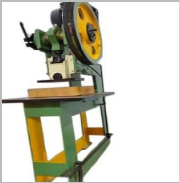
5 Ton Sole Cutting Machine