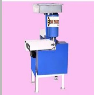
Fully Automatic Dhoop Cone Making Machine