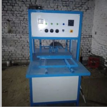
Semi Automatic Scrubber Packing Machine