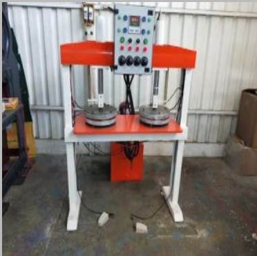
Hydraulic Paper Plate Making Machine