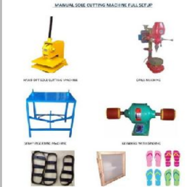
Manual slipper making machine

Sonni Traders is known as top Manufacturer, Supplier and Trader of best Agarbatti Making Machine, Canteen & Kitchen Appliances, Casting, Forging & Moulding Machines, Commercial Kitchen Equipment and Cup Making Machine.