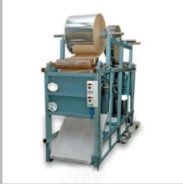
Paper Dona Making Machine