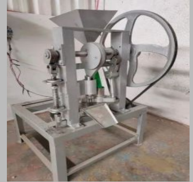
Camphor Tablet Making Machine