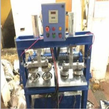
Hydraulic Double Die Multi Purpose Plate Making Machine