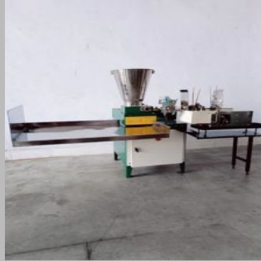
Fully Automatic Agarbatti Making Machine