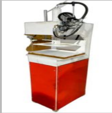
Hydraulic Slipper Making Machine