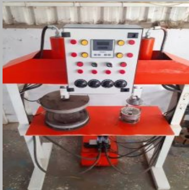
Hydraulic Areca Plate Making Machine