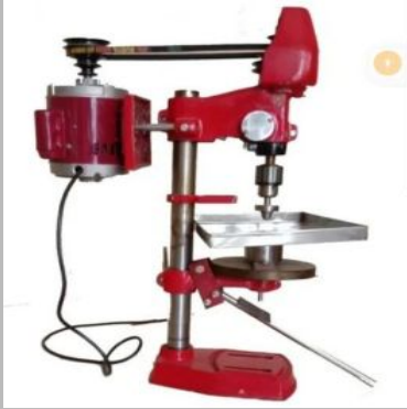
Manual Sambrani Cup Making Machine