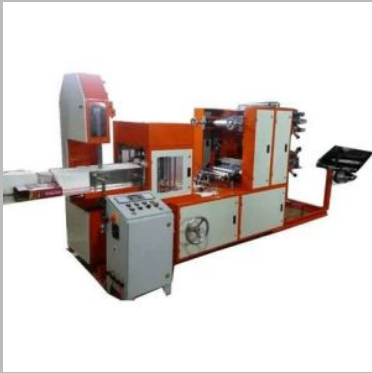
Paper Napkin Making Machine