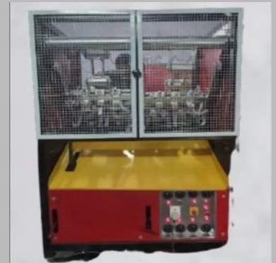
Heavy Duty Paper Plate Making Machine