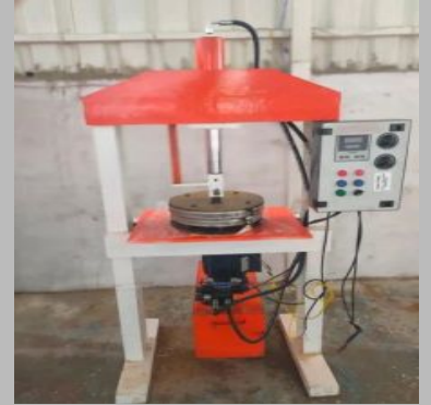
Hydraulic Single Die Paper Plate Making Machine