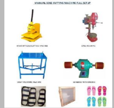
Manual slipper making machine