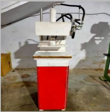
Automatic Hydraulic Sole Cutting Machine