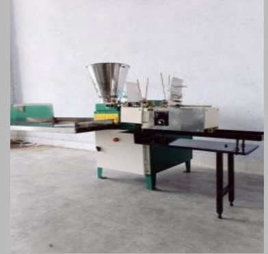
Automatic Agarbatti Making Machine