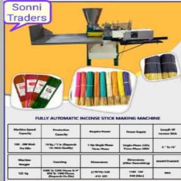
Agarbatti Making Machine