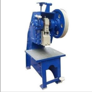
Semi Automatic Sole Cutting Machine