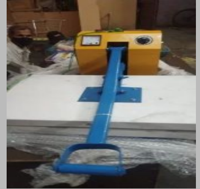
Manual Scrubber Packing Machine