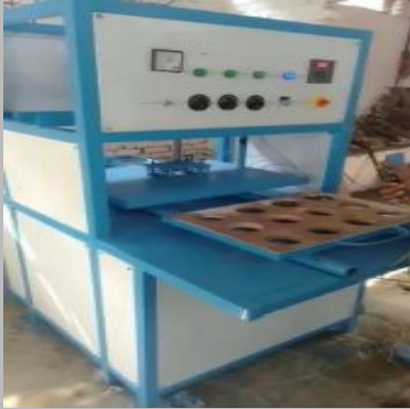
Single Phase Blister Packing Machine