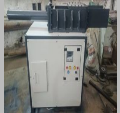
Mild Steel Wet Dhoop Making Machine