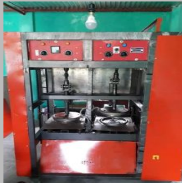
Double Die Thali Crank Machine