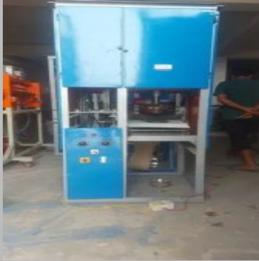
Paper Bowl Making Machine