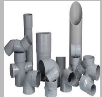
Agriculture Rigid PVC Pressure Pipes