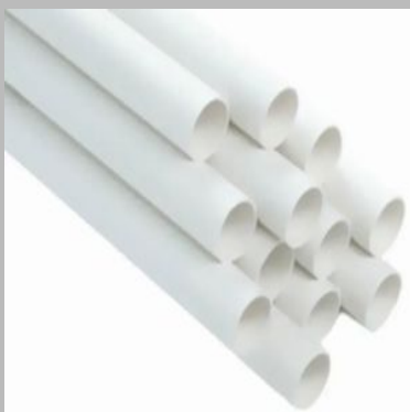
Electrical Conduits PVC Pipes