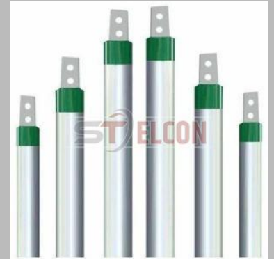
GI Hot Dip Earthing Electrode