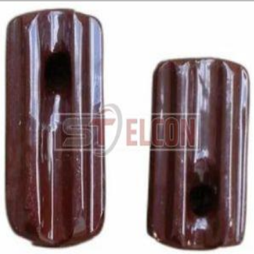
52KV Stay Insulator