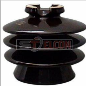
11kv Ceramic Pin Insulator