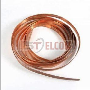
Flat Copper Strip