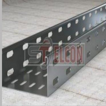
Utility Channel Cable Tray