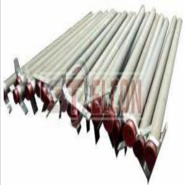
Cast Iron Earthing Electrode Pipe