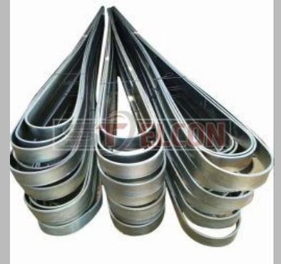
GI Hot Dip Earthing Strip