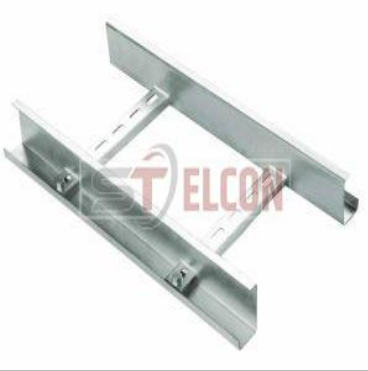
Vertical Outward Cable Tray