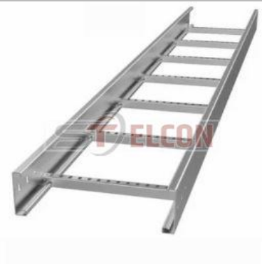
Hot Dip Galvanized Ladder Type Cable Trays