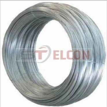
Hot Dip GI Wire