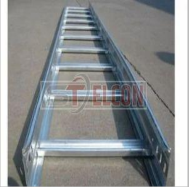
Ladder Type Cable Tray