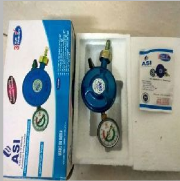
ASI Gas Safety Device