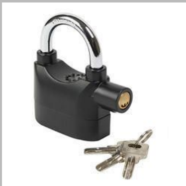
Siren Alarm Lock