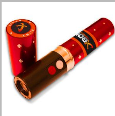
Lipstick Stun Gun