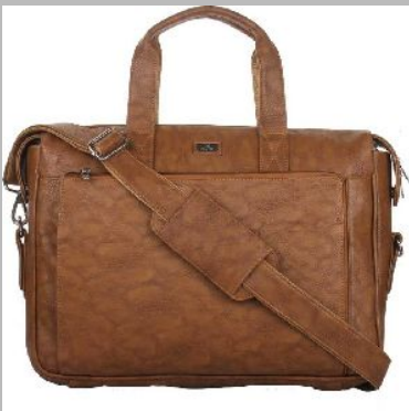
Camel Leather Messenger Bags