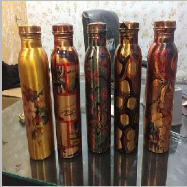
copper water bottle

Sumitra Enterprises is known as top Manufacturer, Exporter, Supplier, Retailer, Trader, Distributor and Importer of best Abdominal Machine, Aluminium, Tin & Metal Containers, Anti Theft Lock, Bags and Candles.