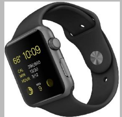
Bluetooth Smart Watch