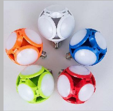
Football LED light