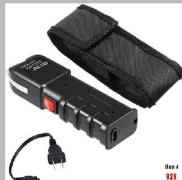
Electric Stun Gun