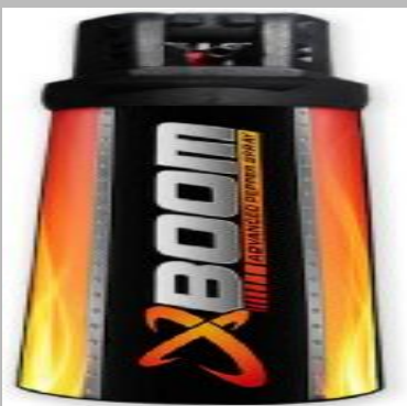
Xboom Advanced Pepper Spray