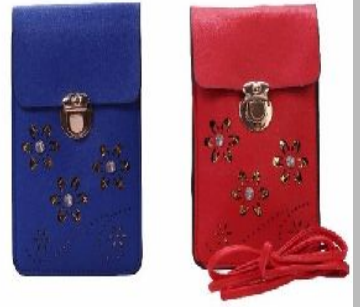
Ladies Tote Bag