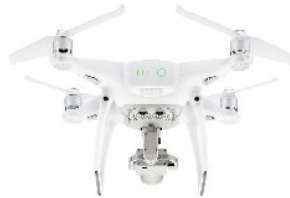
Phantom 4 Pro V2 Drone