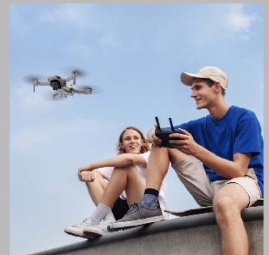
DJI Mavic Mini SE Fly More Combo Drone