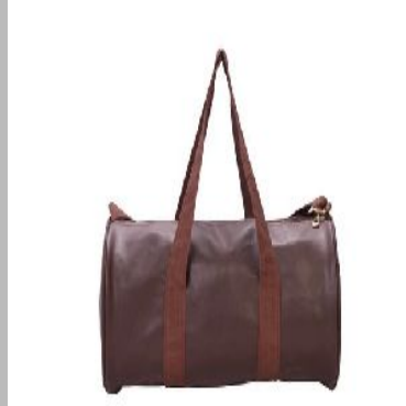
Leather Duffle Bags