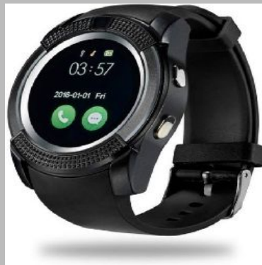
Celestech Touchscreen Smart Watch