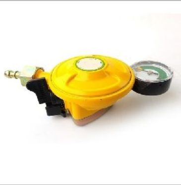
LPG Gas Safety Device