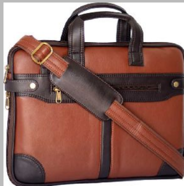
Airleather Laptop Messenger Bags