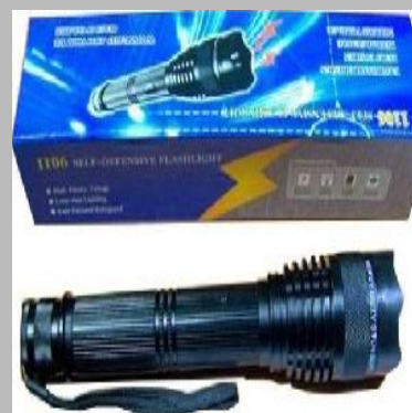
Plastic Flashlight Stun Gun