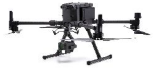
Matrix 300 RTK Drone