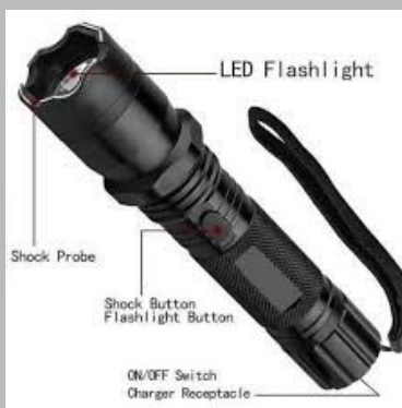
Aluminum Flashlight Stun Gun