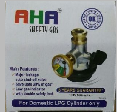
AHA Gas Safety Device