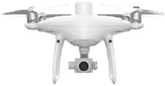
Phantom 4 RTK Drone Camera