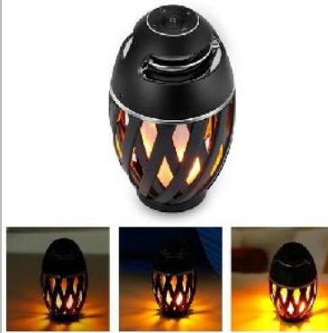
Portable LED Flame Bluetooth Speaker