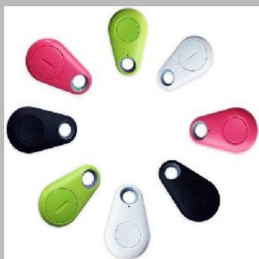
Bluetooth GPS Location Smart Tracker