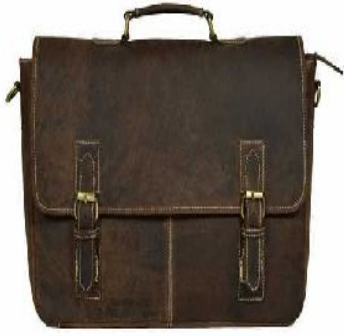
Vintage Leather Messenger Bags