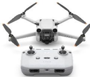
DJI Mini 3 Pro Drone