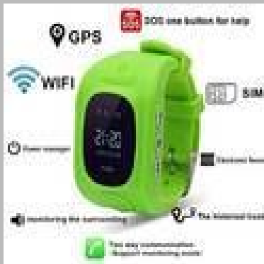
GPS Tracker Kids Smart Watch