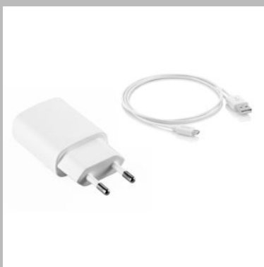
Mobile Phone Charger