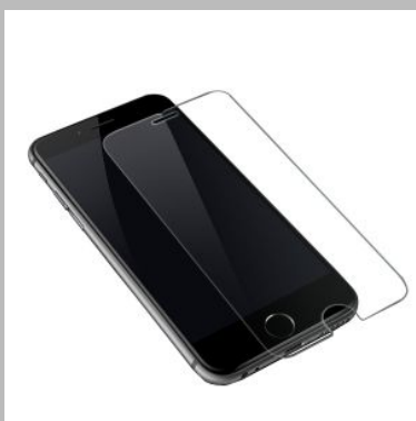
Gorilla Tempered Glass