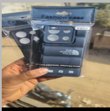
plastic mobile phone cover