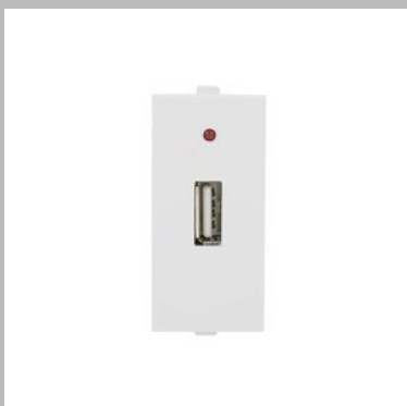
USB Mobile Charger Socket