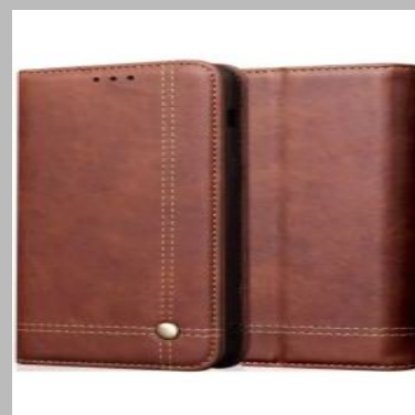
mobile phone cover