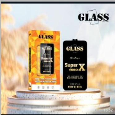
mobile tempered glass guard