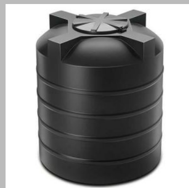
PVC Water Storage Tank