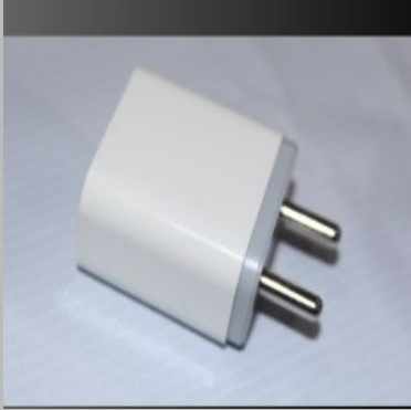
usb data cable mobile charger