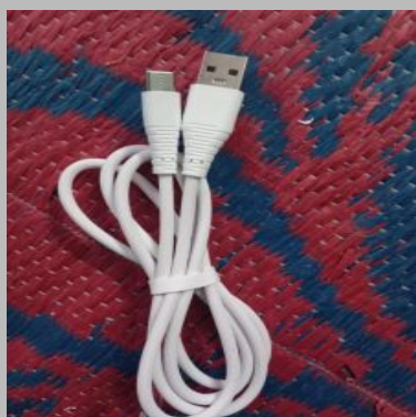
USB Data Cable