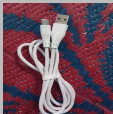
USB Data Cable