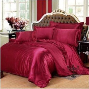
Silk Bed Sheet