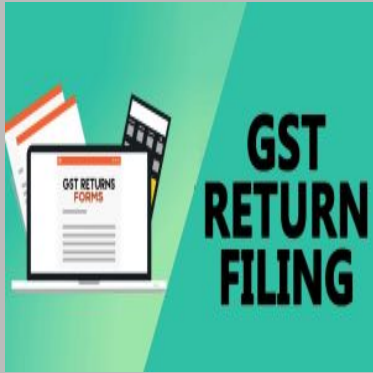
gst return filing service