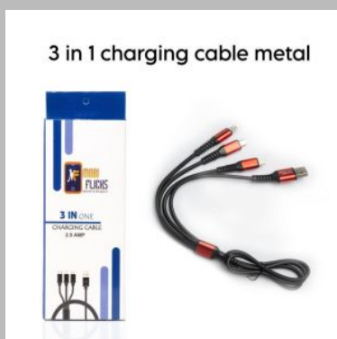
usb charging cable