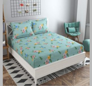
Elastic Fitted Bed Sheet