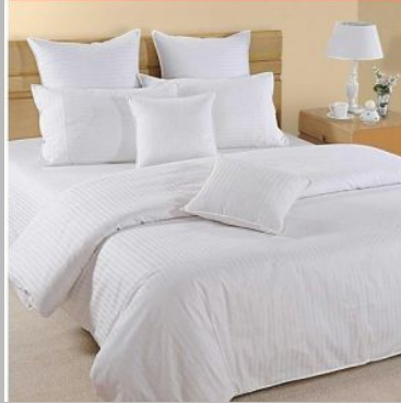
King Size Bed Sheet