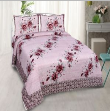
cotton bed sheet