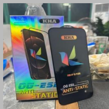
mobile tempered glass