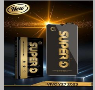
diamond mobile screen guard