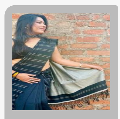
Stripes Pattern Pure Cotton Saree