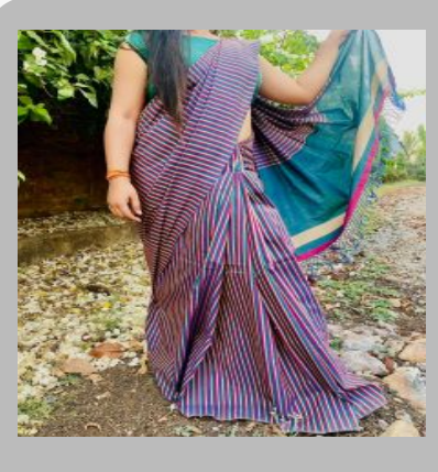
Purple Color Dual Tone Cotton Saree