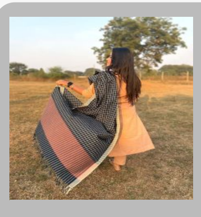
Multicolor Mercerized Cotton Dupatta