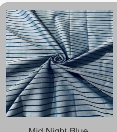
Mid Night Blue Mercerized Cotton Fabric