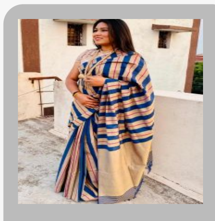
Designer Mercerized Cotton Saree