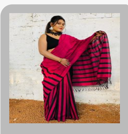
Red Color Dual Tone Cotton Saree