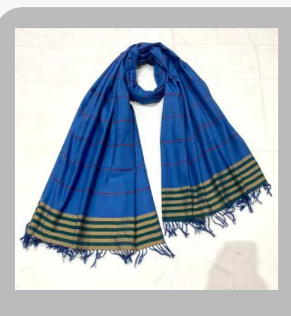
Handwoven Cotton Dupatta