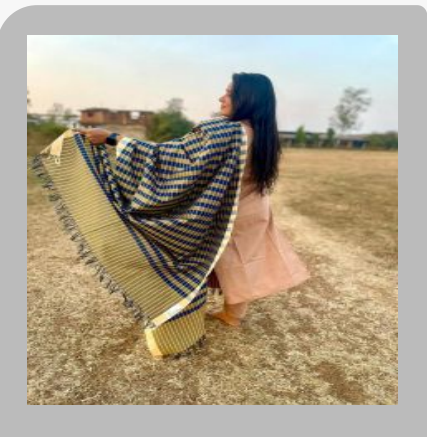
Metallic Designer Checks Dupatta