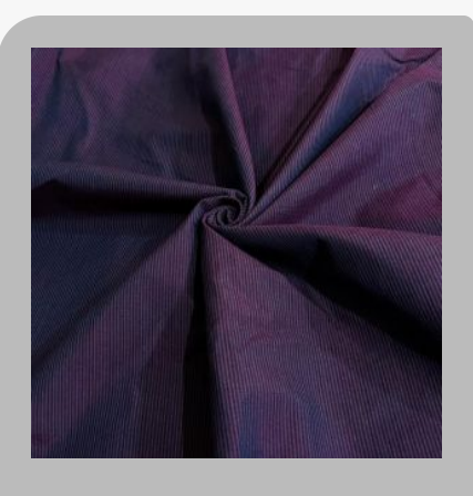
Wine Mercerized Cotton Fabric