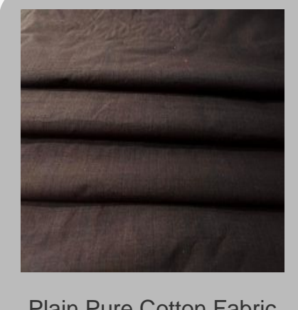
Plain Pure Cotton Fabric