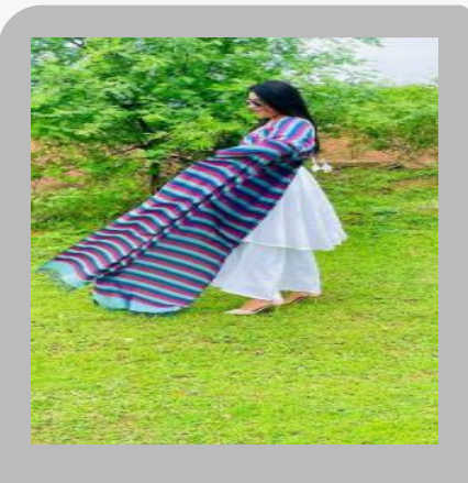
Striped Pattern Mercerised Cotton Dupatta