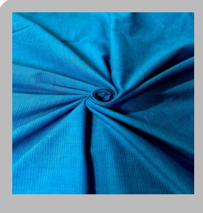
Phiroza Blue Mercerized Cotton Fabric