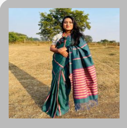
Rama Color Dual Tone Cotton Saree