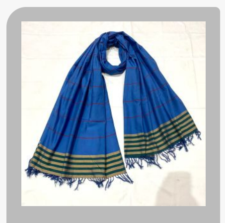
Handwoven Cotton Dupatta

Swastik Weavers & Designer is known as top Manufacturer, Exporter, Supplier, Retailer and Service Provider of best Cotton Sarees, Dupatta, Fabric, Ladies Sarees and Sarees & Lehenga.