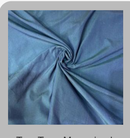
Two Tone Mercerised Cotton Fabric