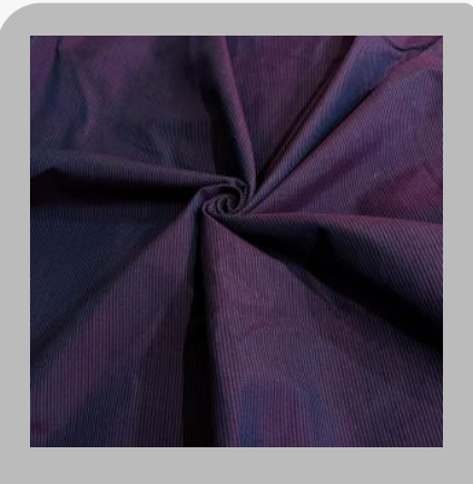
Wine Mercerized Cotton Fabric