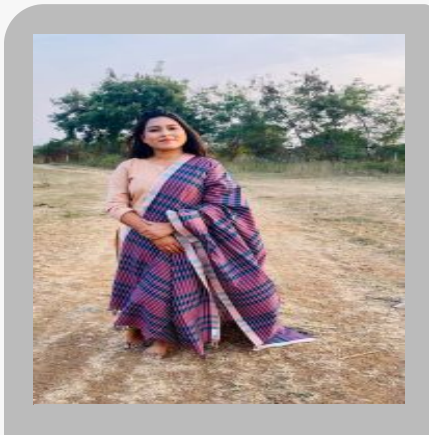
Ladies Designer Checks Dupatta