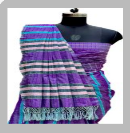
purple stripes pattern mercerized cotton saree