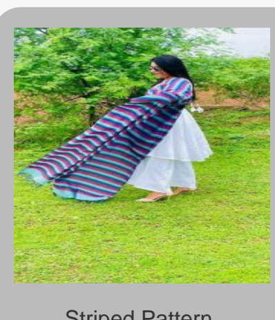
Striped Pattern Mercerised Cotton Dupatta