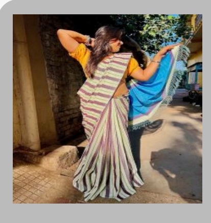
Stripes Pattern Mercerised Cotton Saree