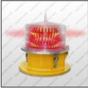
Medium Intensity Aviation Obstruction Light