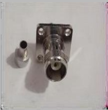
Smb crc9 4.3 1.0 Tnc jumper rp sma testing Cable Connector