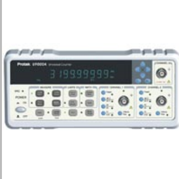
Universal Frequency Counter