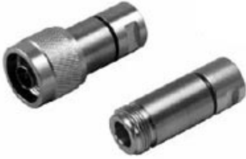
Power Coaxial Termination