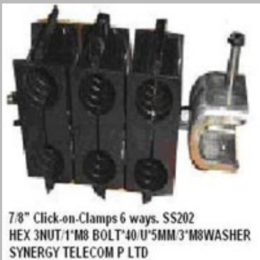
6way Feeder Clamp