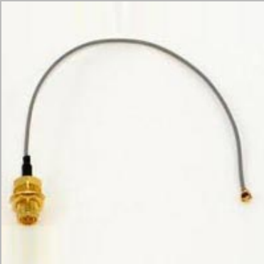
Ufl Cable 600 Mm