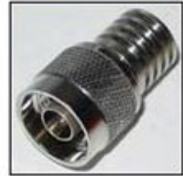
60 w 50 e 4ghz rf coaxial attenuator