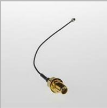
Ufl Cable 150mm