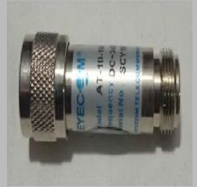
fixed variable rf co-axial testing attenuator