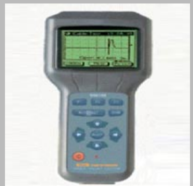
Cable Fault Locator