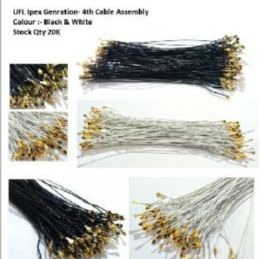
UFL to UFL 4th Generation Cable Assembly 100mm