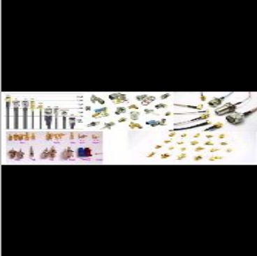
smb rf coaxial connector