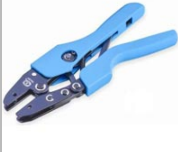
Ratchet Crimping Tools