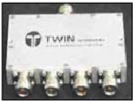
cavity antenna feeder cable 4 way splitter