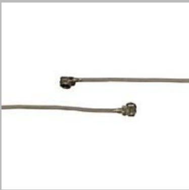
Ufl Cable 400 Mm