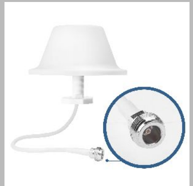
4dbi 698 -3800mhz omni antenna