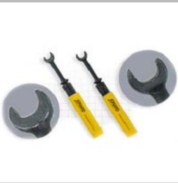
Tyco Torque Wrench