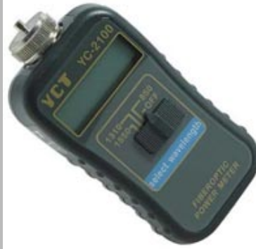
Ethernet Media Converter