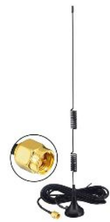
6dbi GSM Magnetic Base Antenna with 3Mtr Wire