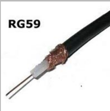
rg 59 cable jumper cables