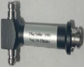
Rf Power Splitter Cavity and Microstrip