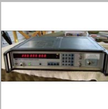
Microwave Frequency Counter