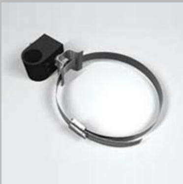
Throat Hoop Feeder Clamp