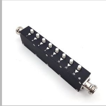
6ghz vswr nm nf bnc rf coaxial fixed attenuator