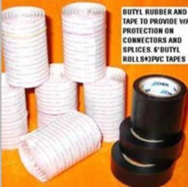
Weather Proofing Kit