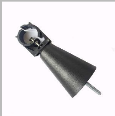
leaky feeder cable clamp metro tunnel railways high speed trains