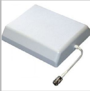
9dbi Patch Panel IMP Antenna 698-2700Mhz N F