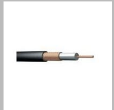
Rg 58 Cable