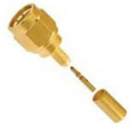
Straight Connector Plug