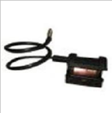
Outdoor Grounding Kit Clamp