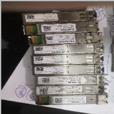
fiber optic media converter sfp Transceiver