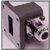
Wave Guide Flange Connector