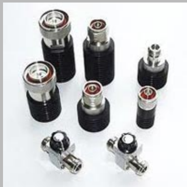
Dummy Load 1 10 50 100 200W 50e Attenuator splitter Combiners