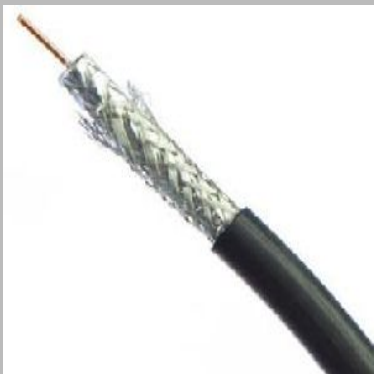
rg lmr 300 coaxial hlf ufl rf cable