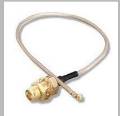
Ufl 100mm Cable