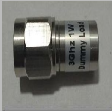
rf vswr dummy load termination