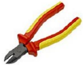
Precise Wire Cutter