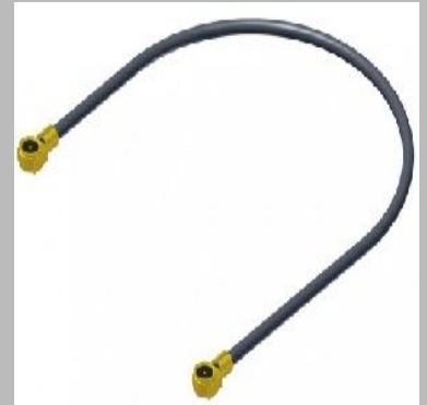
ufl cable connector ipx internal outdoor Cable rf coaxial jumper