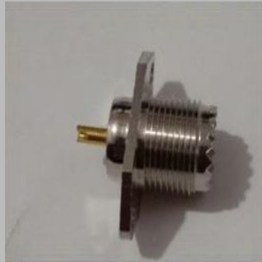
uhf vhf antenna cables connector