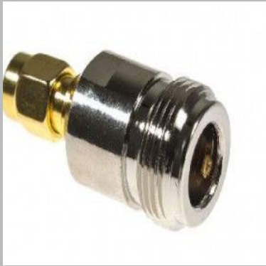
SMA M to N F Adaptor

Synergy Telecom Pvt. Ltd. is known as top Manufacturer, Exporter, Supplier, Retailer, Trader, Distributor, Importer and Buying House of best 5G Components, Antenna, Antenna Accessories, Antenna GSM GPS 5G 4G RFID IOT ISM UFL and Antennas 5g 4g wifi rfid gsm gps gprs iot.