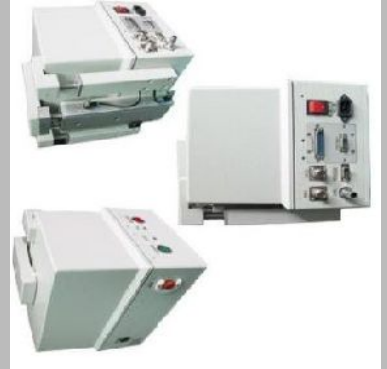
RF Shield Box