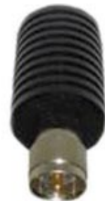
Dummy Load 10w