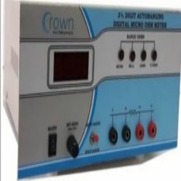
Digital Micro Ohm Meter