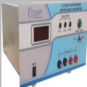
Micro Ohm Meter 10 Ampere