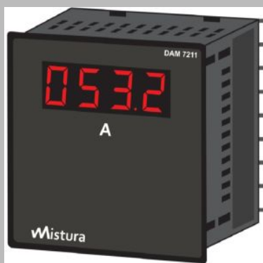
Digital Ampere Meter