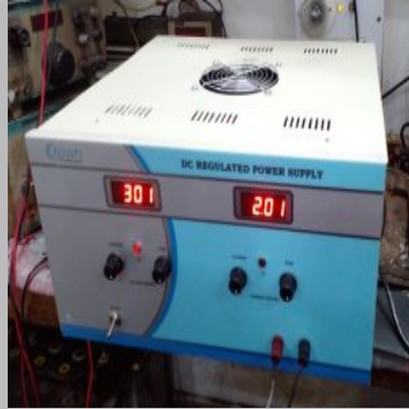
Regulated Power Supply System