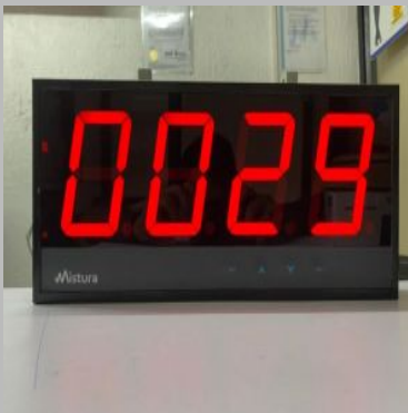
4.0&quot; Jumbo Digital Temperature Indicator