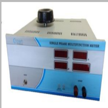
SINGLE PHASE TRMS DIGITAL MULTIFUNCTION METER WITH AC SOURCE 300V AC