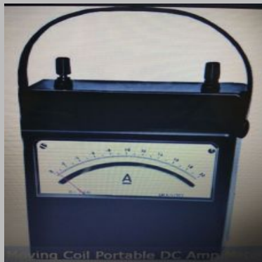
MOVING IRON TYPE AC/DC AMP METER