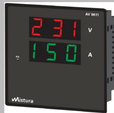
DIGITAL VOLT+AMPERE COMBINE METER