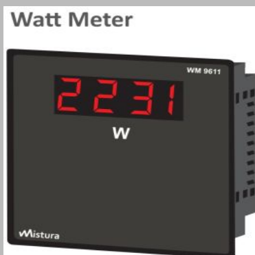
Single Phase Digital Watt Meter