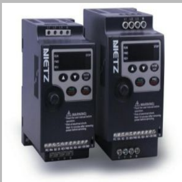
Variable Frequency Drive