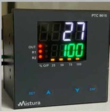
Universal Input PID Temp. Controller (4 + 4 Digit Dual Display)