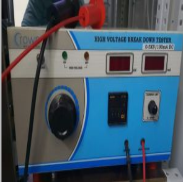
Voltage Breakdown Insulation Tester