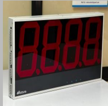
8.0&AMP;AMP;AMP;AMP;quot; Single Side Process Jumbo Indicator (Analog Input)