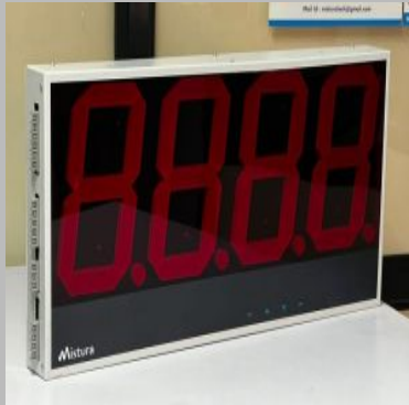
8.0&AMP;AMP;quot; Single Side Process Jumbo Indicator With Retransmission (Analog Input)