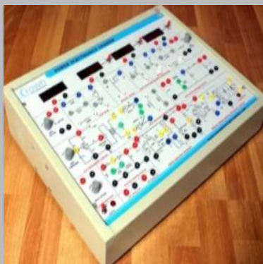
Digital IC Trainer Kit