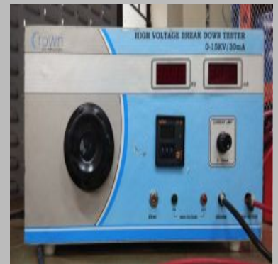
HIGH VOLTAGE TESTER