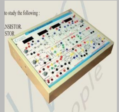
Power Electronic Trainer Kit