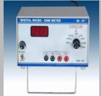
Micro Ohm Meter