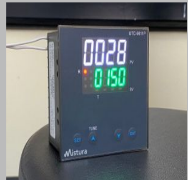
Cooling Controller (3 Digit Display) With NTC Sensor