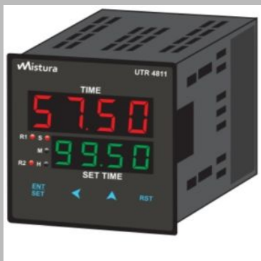
Paper Plate Up Down Timer