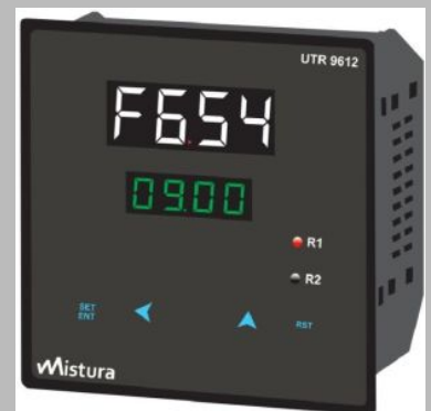
Multi Function Cyclic Programmable Timer