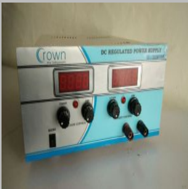
Programmable DC Power Supply 0-32V / 20Amp