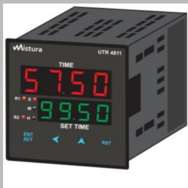
Multi Function Forward Reverse Programmable Timer