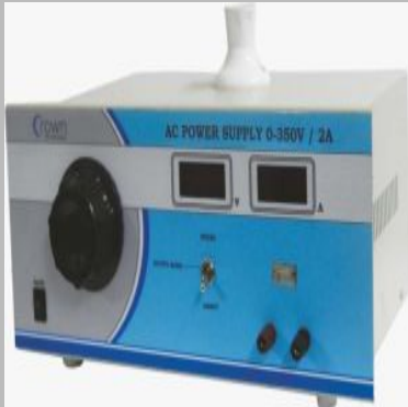
AC Variable Power Supply