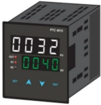
Universal Input PID Temperature Process Controller With RS-485 Modbus