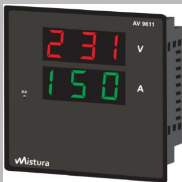
DC DIGITAL VOLT+AMPERE COMBINE METER