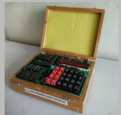
8085 Microprocessor Training Kit With Built In Power Supply