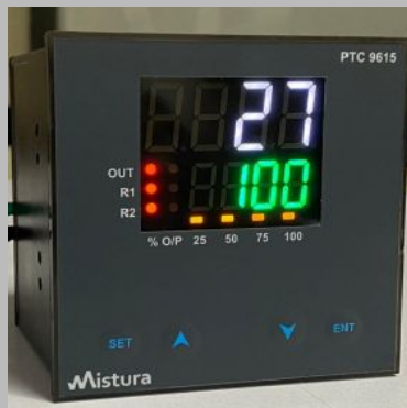
UNIVERSAL INPUT PID TEMP. CONTROLLER