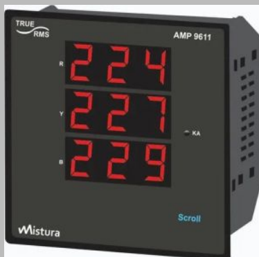
THREE PHASE AMPERE METER