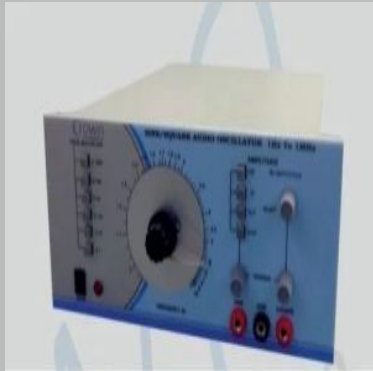
Sine/Square Oscillator 1hz To 1mhz