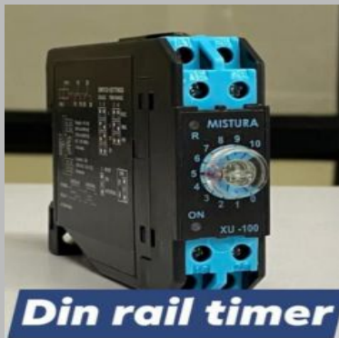
XU100, ON/ Interval Delay TIMER