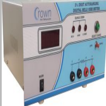
Mili Ohm Meter