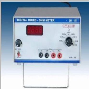
Micro Ohm Meter