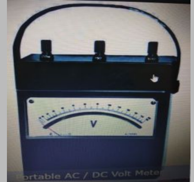
MOVING COIL TYPE DC VOLTMETER