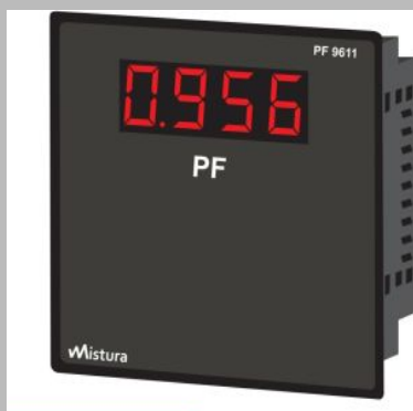
Single Phase Power Factor Meter