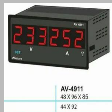
Combined 1 Phase Volt / AMP Meter