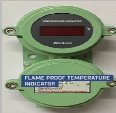
Flame Proof Indicator (Temperature) 4-digit Display