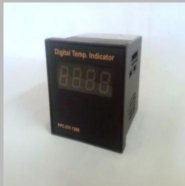
Digital Temperature Indicators