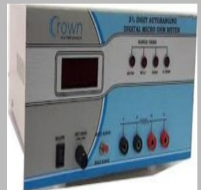
Micro Mili Ohm Meter