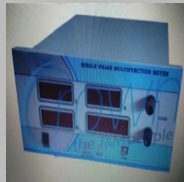
Single Phase TRMS Digital Multifunction Meter