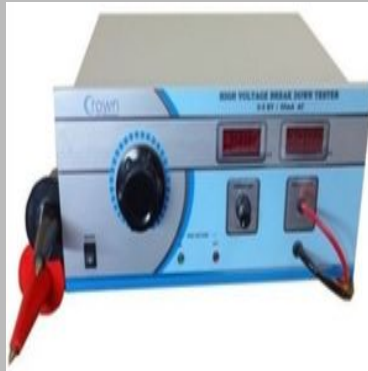
High Voltage Breakdown Flash Tester