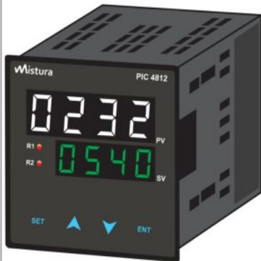
Universal Process Controller