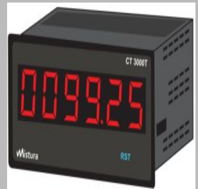
Real Time Clock Based Timers