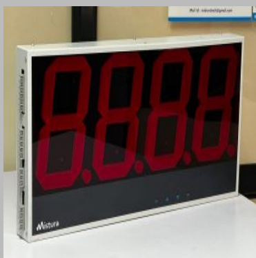
8.0&AMP;AMP;AMP;AMP;quot; Single Side Jumbo Indicator With Humidity Sensor Input