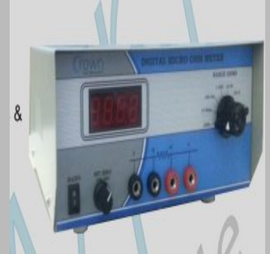
Micro Ohm Meter 53c