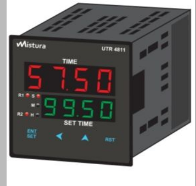
Programmable Temperature Controller ( Double Display, Tp)