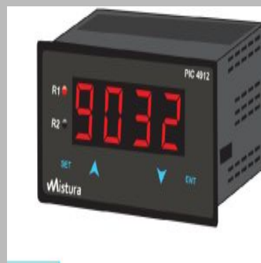
7-Mode Multi Range Process Indicator