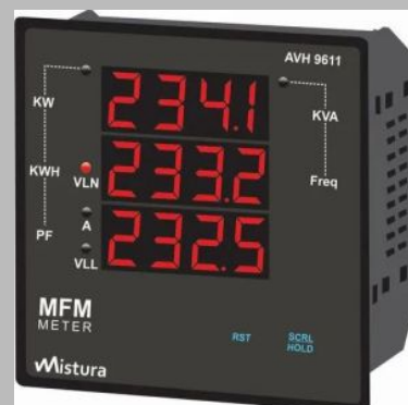
Single Phase Digital Multifunction Meter