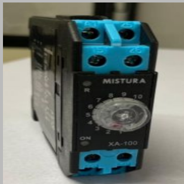
XA100, ON/ Interval Delay TIMER