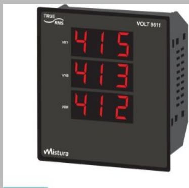
THREE PHASE VOLT METER