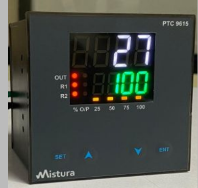
Universal Input PID Temp. Controller With 4- 20mA/0-10VDC &AMP;AMP;AMP;AMP;AMP; RS-485 Modbus