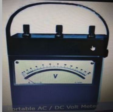
MOVING IRON TYPE AC/DC VOLTMETER