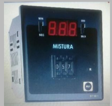
Digital Presettable Timer