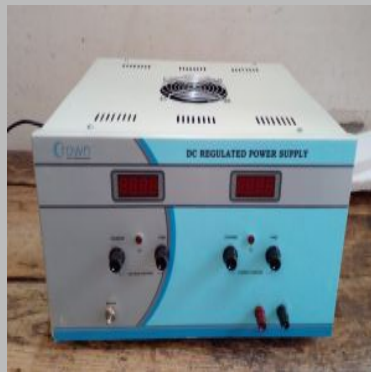
Power Supply System