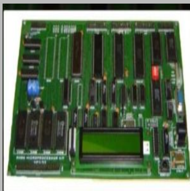
8086 Microprocessor Training Kit With Built In Power Supply