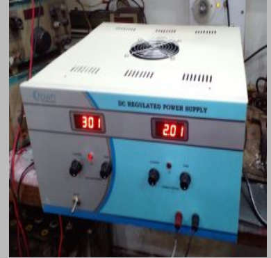
Regulated DC Power Supply