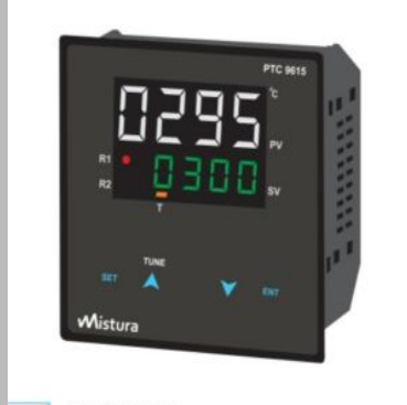
Universal Input Temperature AND Process Controller