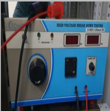
HV Breakdown Voltage Tester