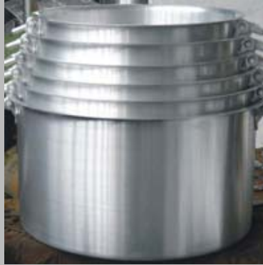
Aluminium Tote 20X60