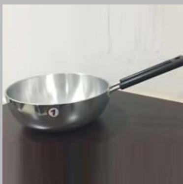
Aluminium Fry Pan