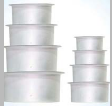
Aluminium Tote 19X28