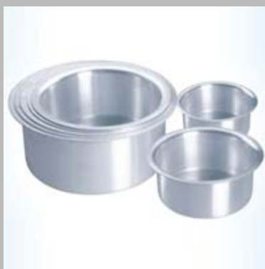
Aluminium Tote 10X18