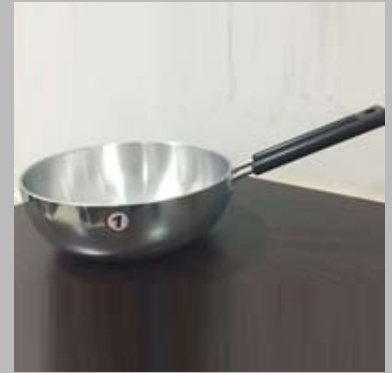
Aluminium Fry Pan