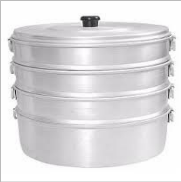
Aluminum Momos Steamer