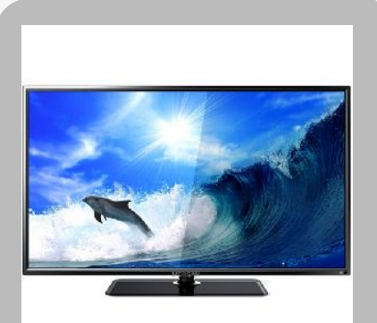
15 Inch High Definition Television