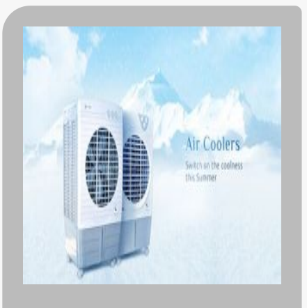
Plastic Air Cooler