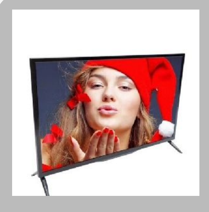
24 Inch High Definition Television