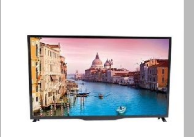
32 Inch High Definition Television