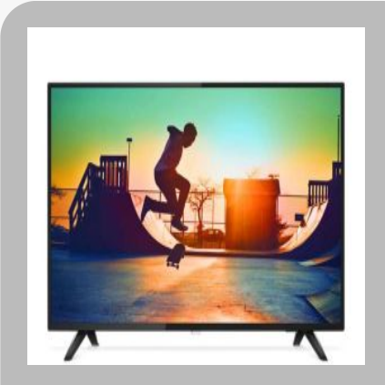
Smart Led Tv