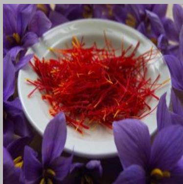
Kashmiri Mongra Saffron