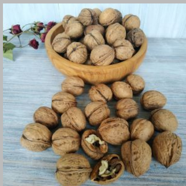
Kashmiri Kagzi Walnuts

Trans Asia Traders is known as top Manufacturer, Exporter, Supplier, Trader and Importer of best Automobile Gears, Clutch Bags, Dehydrated Fruits, Dry Fruits and Electrical Equipments.