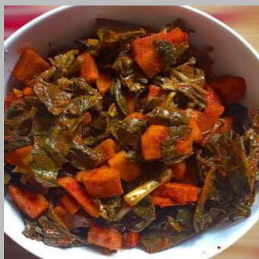
Kashmiri Mix Veg Pickle