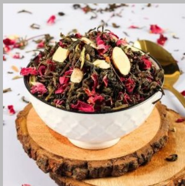
Kashmiri Kahwa Green Tea