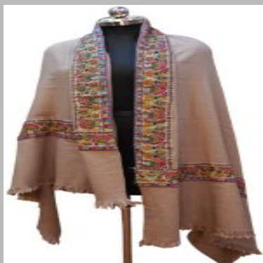
Kashmiri Semi Pashmina Shawl