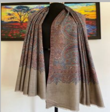
Kashmiri Pashmina Shawl