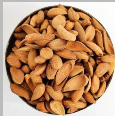
Kashmiri Mamra Almonds