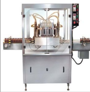
Syrup Filling Machine