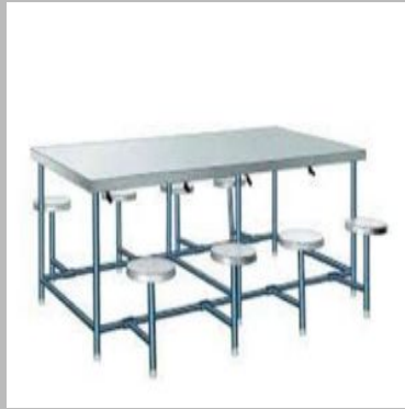
Canteen Dining Table