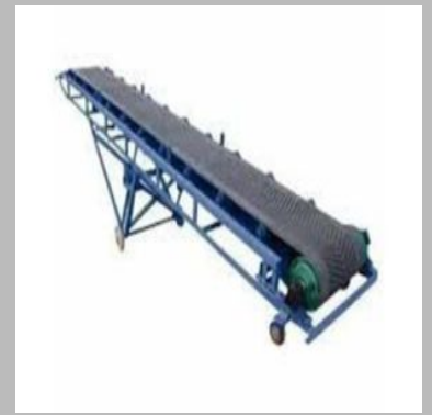
Modular Belt Conveyor