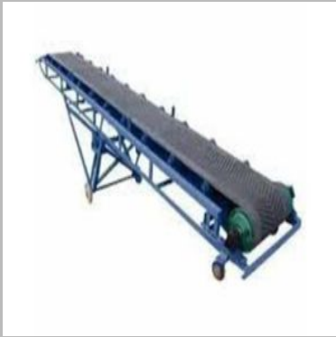
Modular Belt Conveyor