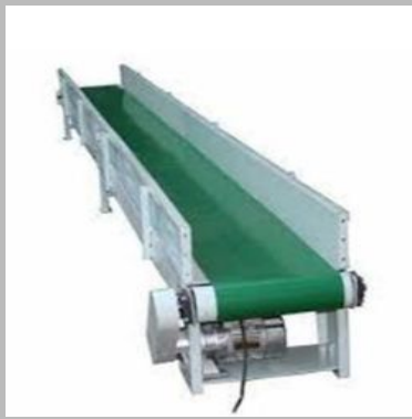
Flat Belt Conveyor