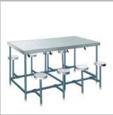
Canteen Dining Table

We V A Enterprises are a leading and distinguished Manufacturer, Supplier and Trader of quality Carton Sealers, Conveyors, Greenhouse Accessories, Inclined Conveyor and Industrial Carts.