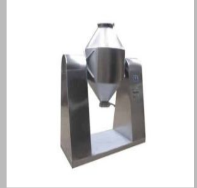
Pharma Powder Blender