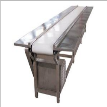
Food Grade Conveyor