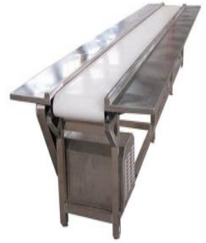
Food Grade Conveyor