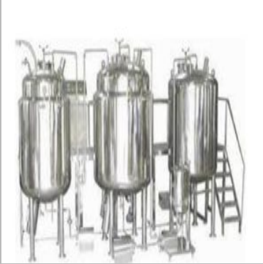
Syrup Homogenization System