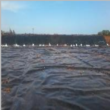
HDPE Geomembrane Sheet

V. K. Pack Well Private Limited is known as top Manufacturer and Exporter of best Agricultural Irrigation Systems, Irrigation System, LAY FLAT TUBES, Organic Fertilizer and Plastic Sheets.