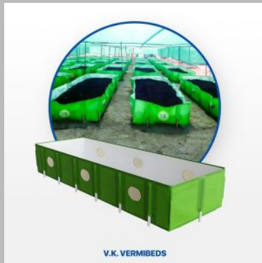
HDPE Vermi Bed