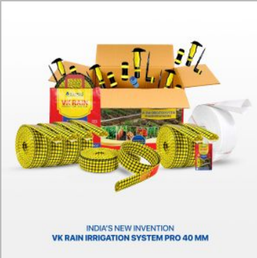
Rain Pipe Irrigation System