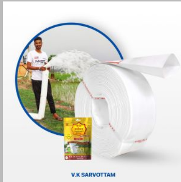
HDPE Lay Flat Pipe