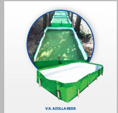
HDPE Azolla Bed