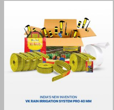
Rain Pipe Irrigation System