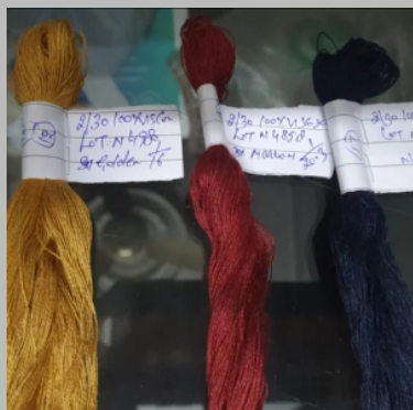
Viscose Dyed Yarn