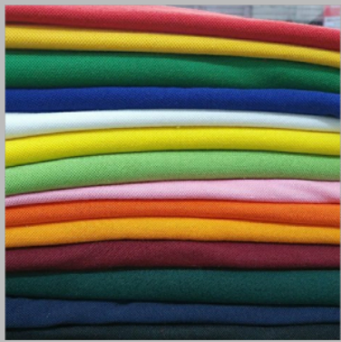
Spun Matty Fabric