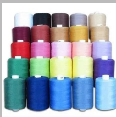
Cotton Dyed Yarn