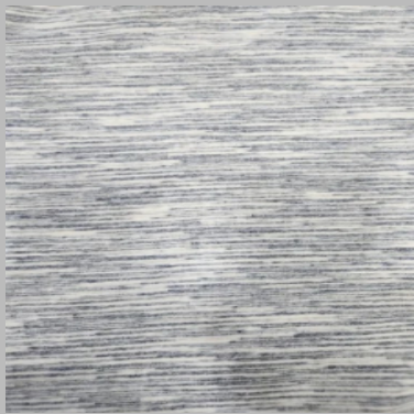
Textured Cotton Fabric