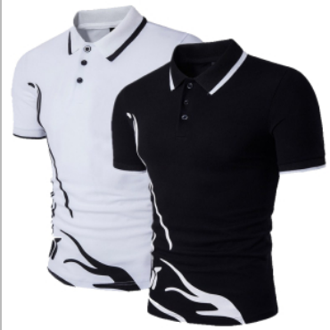
Mens Polo T-Shirts