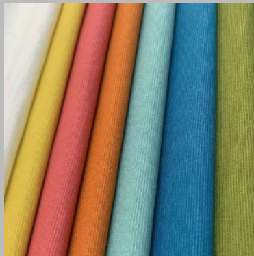
Air Jet Single Jersey Fabric