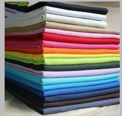
Spun Single Jersey Fabric