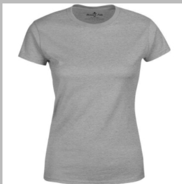
Ladies Round Neck T-Shirts