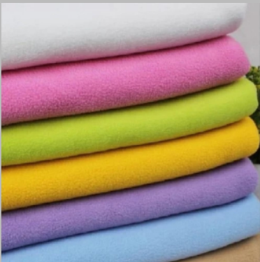
Air Jet Fleece Fabric