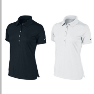
Ladies Polo T-Shirts