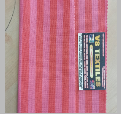
cotton poly 1x1 rib fabric