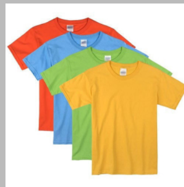
Kids Round Neck T-Shirts