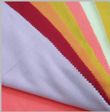
Spun Fleece Fabric