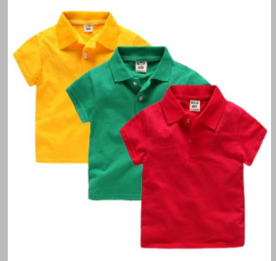
Kids Polo T-Shirts