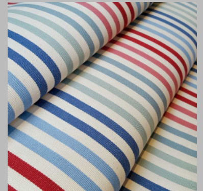
Auto Stripe Fabric