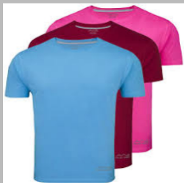
Mens Round Neck T-Shirts