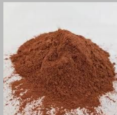
Foundry Grade Bentonite