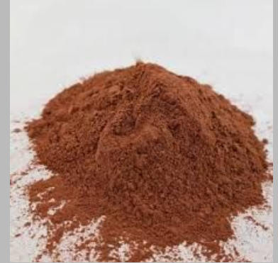
Foundry Grade Bentonite