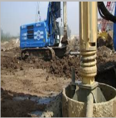
Pilling Grade Bentonite