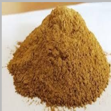
Drilling Grade Bentonite Powder

VARDHAN RESOURCES INDIA INTERNATIONAL is known as top Exporter, Supplier, Retailer, Trader, Distributor, Importer and Service Provider of best Acid Proof Mortar, Bentonite, Bricks & Construction Materials, Calcined Bauxite and Calcium Carbonate Powder.