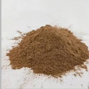
Fertilizer Grade Bentonite