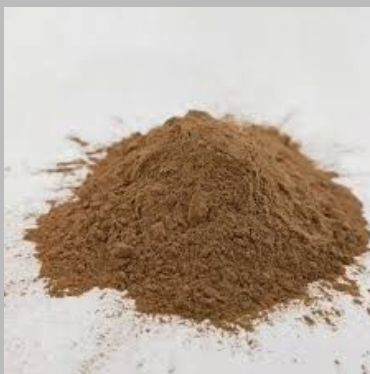
Fertilizer Grade Bentonite