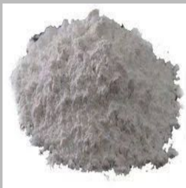
Concrete Grade Calcium Carbonate Powder