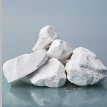
Crude China Clay