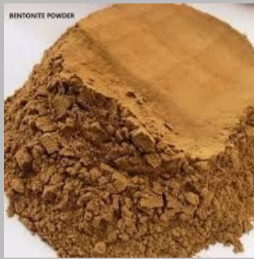
Cattle Feed Grade Bentonite Powder