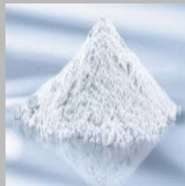
Water Treatment Based Calcium Carbonate Powder