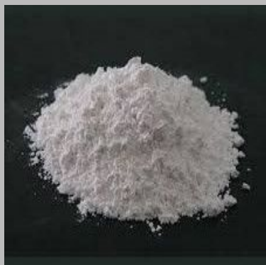
Pigment Grade Calcium Carbonate Powder