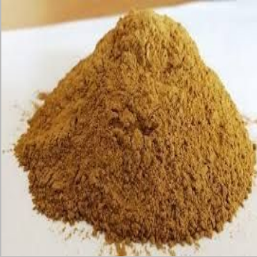
Drilling Grade Bentonite Powder