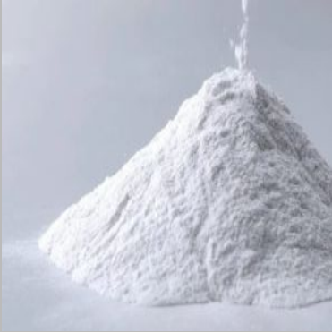
Silica Quartz Powder