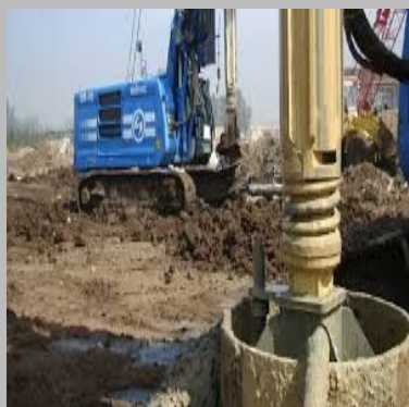
Pilling Grade Bentonite