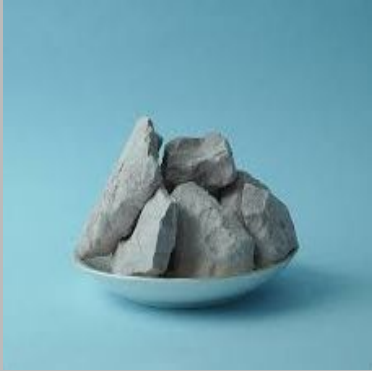
Levigated China Clay