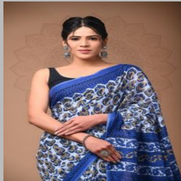
Hand Block Printed Saree