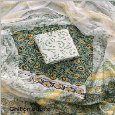
Hand Block Printed Cotton Suit with Dupatta

We Keshvi Hand Print are a leading and distinguished Manufacturer, Supplier and Retailer of quality Bed Linen, Block Printed Fabric, Block Printed Sarees, Cotton Bed Sheets and Ladies Sarees.