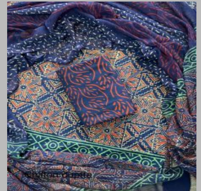
Hand Block Printed Cotton Dress Fabric