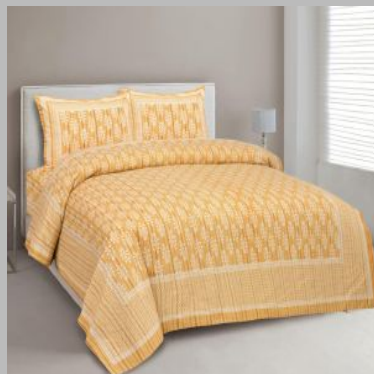
Hand Block Printed Cotton Bed Sheet