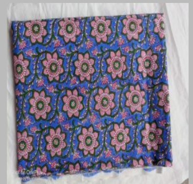
Jaipuri Hand Block Printed Cotton Fabric