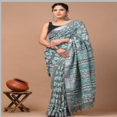
Hand Block Printed Cotton Linen Saree