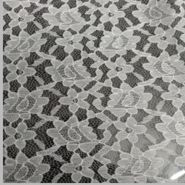
Maharani Net Fabric