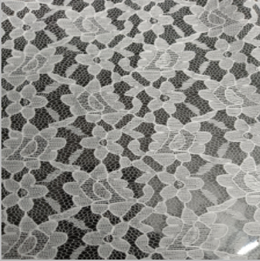
Maharani Net Fabric

Vasu Enterprises is known as top Manufacturer and Supplier of best Cotton Textile, Home Decor Fabric, Laces, Interlinings & Other Accessories, Natural Fabrics and Net Fabrics.