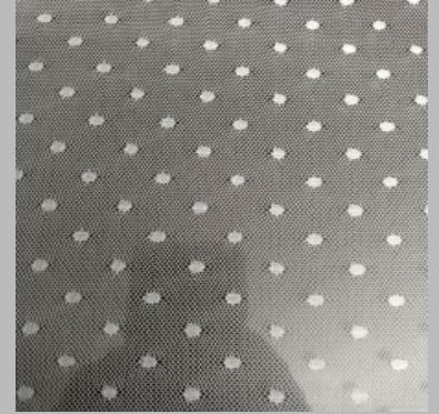
Polyester Net Fabric