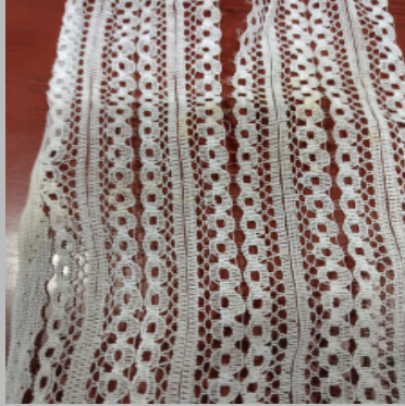
Nylon Net Fabric