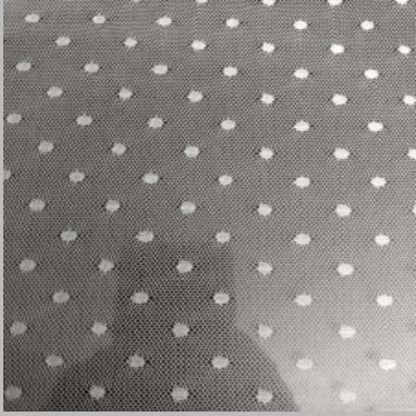
Polyester Net Fabric