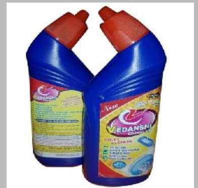
250 ML Liquid Toilet Cleaner