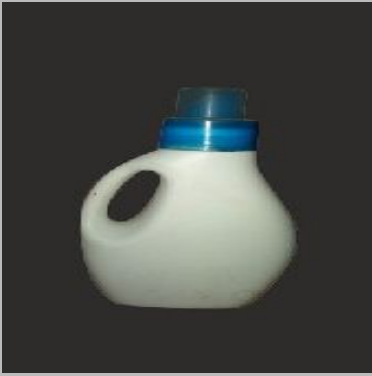
Liquid Laundry Detergent

Vedanshi Chemicals Private Limited is known as top Manufacturer, Exporter, Supplier, Retailer, Trader, Distributor and Importer of best Cleaning Wipes & Liquids, Detergent, Floor Cleaner, Phenyl and Soaps & Detergents.