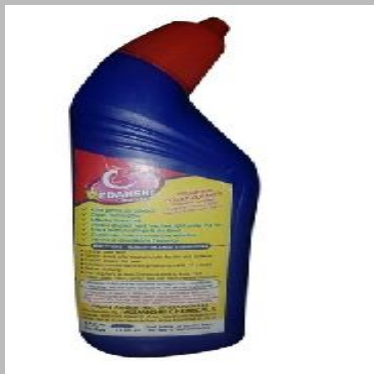
500 ML Liquid Toilet Cleaner