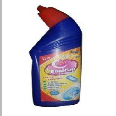
5 Ltr Liquid Toilet Cleaner