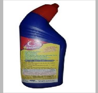
500 ML Liquid Toilet Cleaner