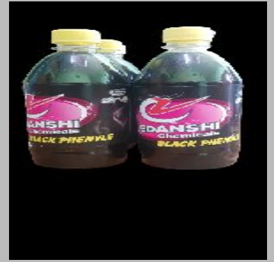
Black Floor Cleaner Liquid