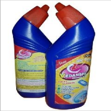
250 ML Liquid Toilet Cleaner