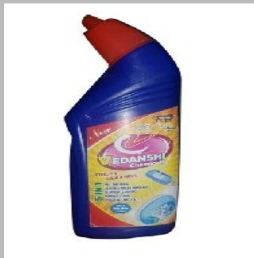
5 Ltr Liquid Toilet Cleaner