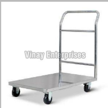
Stainless Steel Platform Trolley