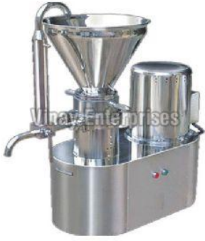
Vertical Colloid Mill