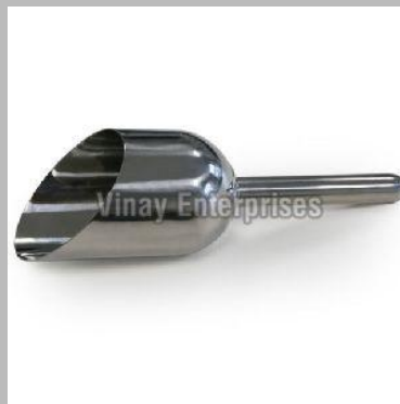
Stainless Steel Scoop