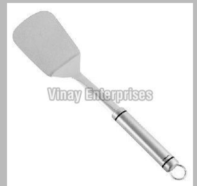
Stainless Steel Spatula