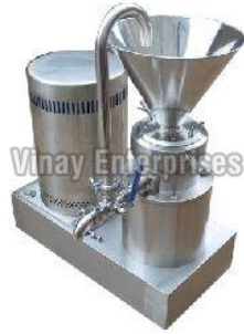
Horizontal Colloid Mill