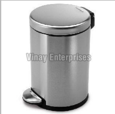
Stainless Steel Foot Operated Dustbin

We Vinay Enterprises are a leading and distinguished Manufacturer, Exporter, Supplier and Retailer of quality Buckets, Mugs & Storage Bins, Chemical Reactors & Process Tanks, Coffee Mugs, Teapot & Tea Sets, Dryers and Dustbin.