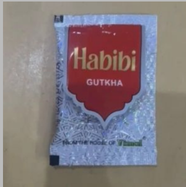
habibi gutkha packaging pouches