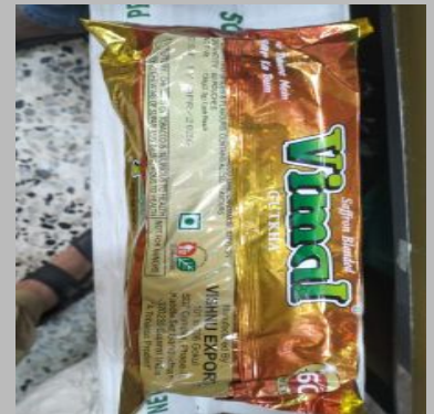
Vimal Gutkha Export Quality Packing Pouch (Dubai)