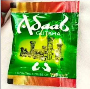
Adaab Gutkha Export Quality Packing Pouch