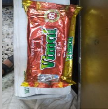
Vimal Gutkha Export Quality Packing Pouch