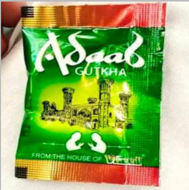
Adaab Gutkha Export Quality Packing Pouch