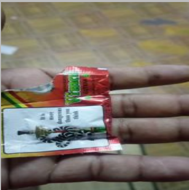
VIMAL Gutkha Packing Pouch