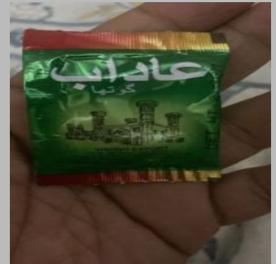
Adaab Gutkha Packaging Pouches