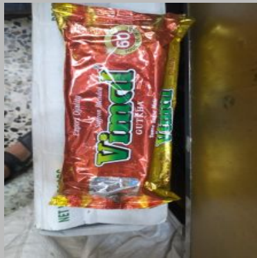
Vimal Gutkha Export Quality Packing Pouch