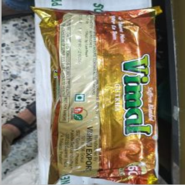
Vimal Gutkha Export Quality Packing Pouch (Dubai)