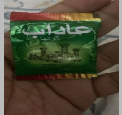
adaab gutkha packing pouch