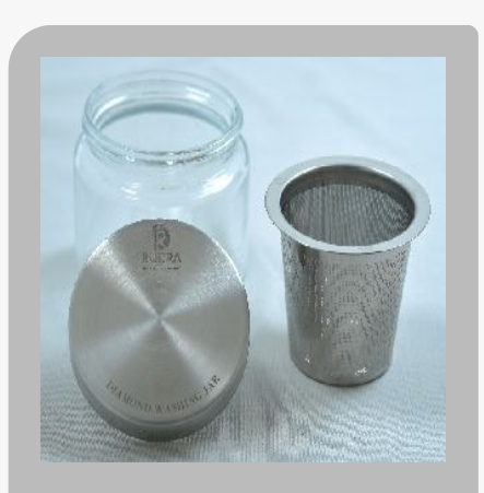
Diamond washing jar