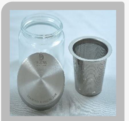
Diamond washing jar