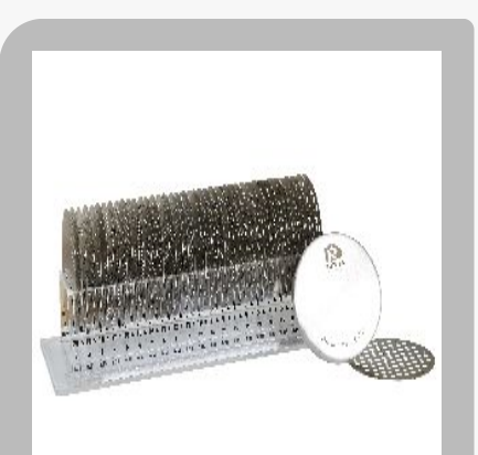
Diamond sieves stand