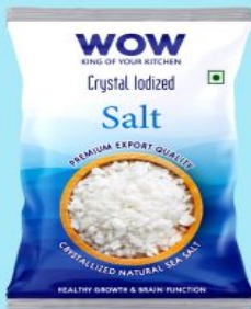
WOW Crystal salt