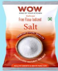
WOW free flow salt