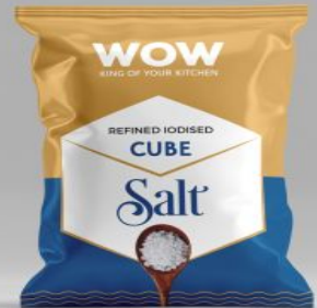
WOW Cube salt