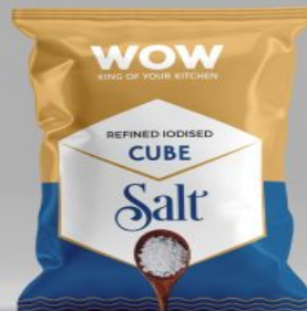
WOW Cube salt