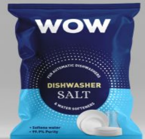
WOW Dishwasher salt