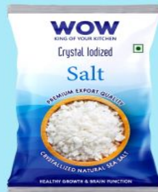
WOW Crystal salt