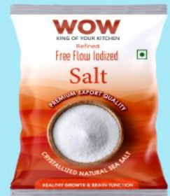
WOW free flow salt