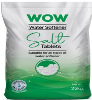
WOW Salt tablets

We VRK Salt Solutions are a leading and distinguished Manufacturer, Exporter, Supplier, Retailer, Trader, Distributor, Importer and Service Provider of quality Edible Salt, Industrial Salts, Salt tablets and Softener salt.