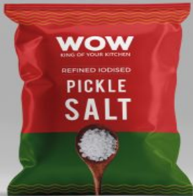
WOW Pickle salt